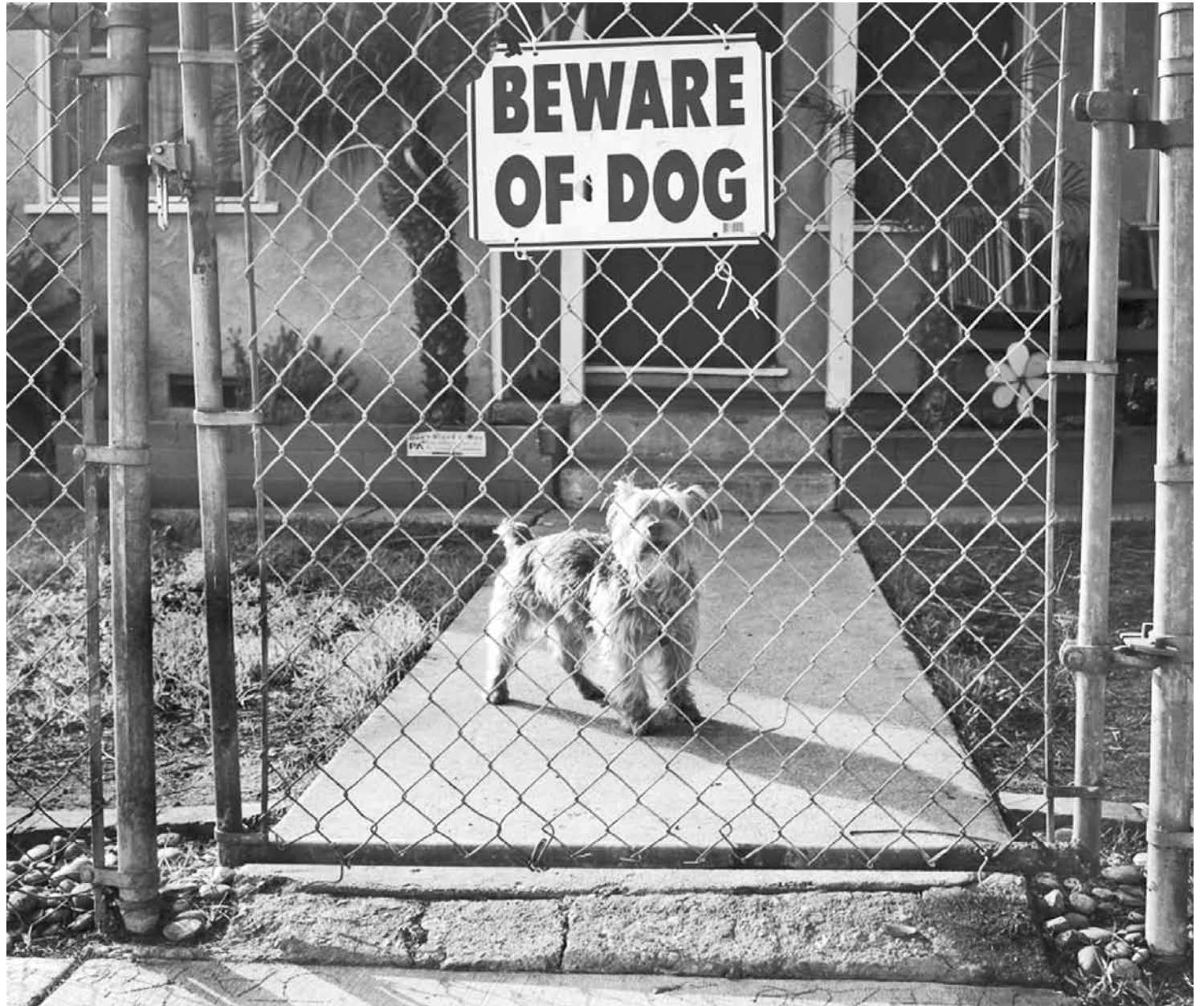
A fierce guardian keeps an eye on the neighborhood; our Lawndale photographer notes that "the sign is bigger than the dog."