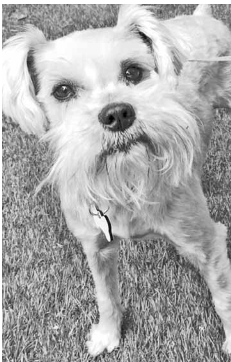
Cora and Nora are best friends and would love to stay together.

Are you looking for a really sweet 5-month old, female Miniature Schnauzer mix? If so, just ask for Pookie!! I was rescued from a LA county shelter where I ended up as a stray after getting lost. Everyone says I'm cute as a button and I have a wonderful personality. Although I'm a tad larger than a purebred Miniature Schnauzer puppy would be, I've got all of that puppy playfulness and curiosity. Currently, I weigh 11 pounds but I'll probably be about 20-25 pounds when I'm full-grown - still small enough to be a great cuddler and an even better companion. If you are interested in Pookie, please email info@msfr.org for more information. •