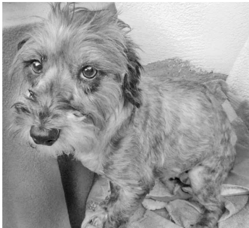
Katrina has a new family with brand new sisters to love.

Congratulations to Katrina , our shy, little, Schnauzer/Doxie mix that was rescued in late August, and her new family. They had recently lost their 14-year old Schnauzer and were looking for someone who needed them as much as they needed her. Katrina had been passed over at adoptions because of her