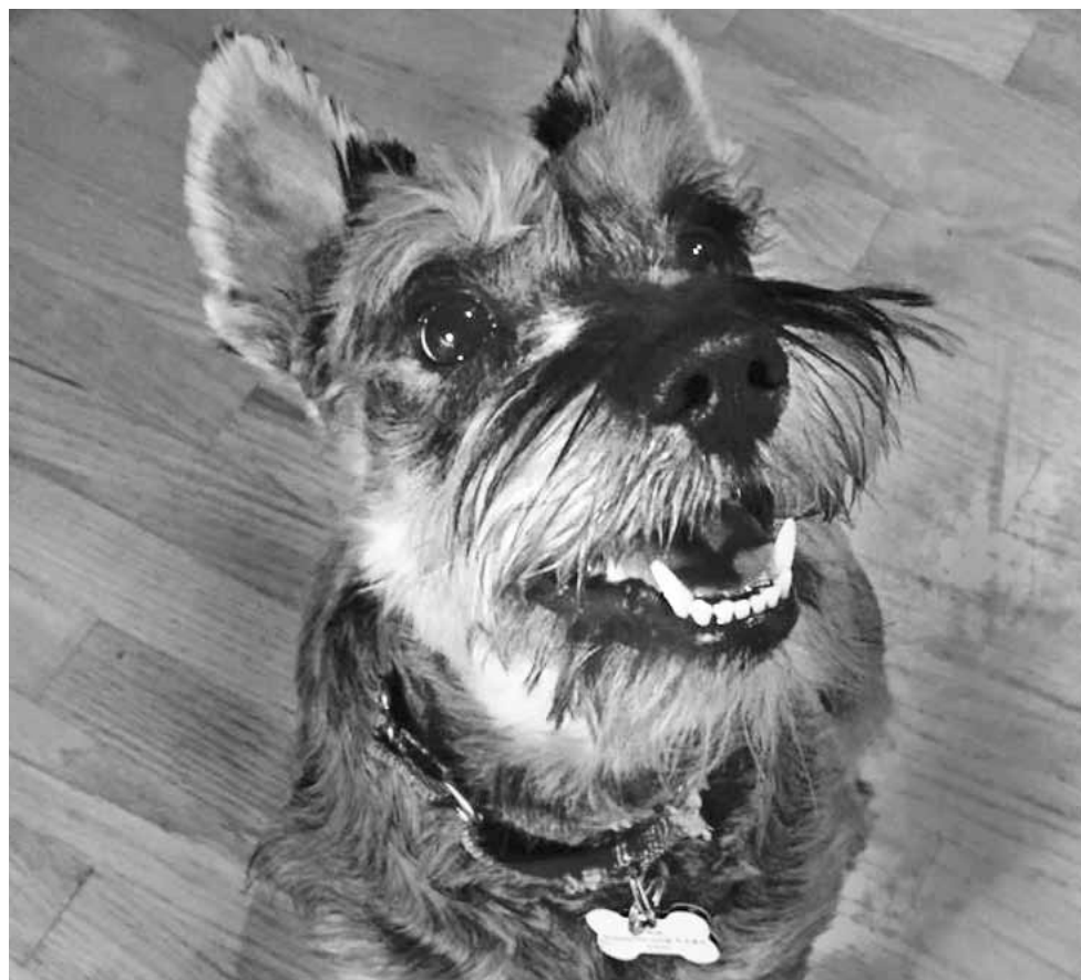
Suzy-Q is on a special diet for bladder stones.

We are looking for volunteers to help with our pet adoption fairs, which are held every Saturday at the PetCo located at 537 N. Pacific Coast Highway Redondo Beach 90277, from noon-3:30 p.m.. If you are interested in volunteering and can commit to at least one Saturday a month, please contact us at info@msfr.org . You can also visit all of our Miniature Schnauzers & Friends rescues at the adoption fair or check out our website, www.msfr.org . If you have any questions about a particular dog's availability you can email us at info@msfr.org . Schnauzers! Bet you can't adopt just one!