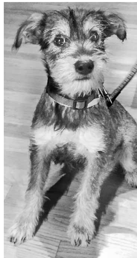
Pookie loves to play and is very sweet.

Hi there - we're Nora and Cora . We were rescued from an LA county shelter where we ended up because we were strays. We could be related but how is a mystery. We're definitely not sisters since Nora is 3.5-years old and weighs 13 pounds while Cora is about 2-years old and weighs 17.5 pounds. One thing for sure is we're the best of friends and we would love to go to the same forever home. We also know that might not be the case but we would do best in a home with another doggie pal to play with. We're very friendly, outgoing and free spirited gals who enjoy each other's company. That's probably why we need some leash training - when we're together we just play and have fun and do what we want. You have to see us to believe how sweet we are. If you are interested Nora and/or Cora, please email info@msfr.org for more information.