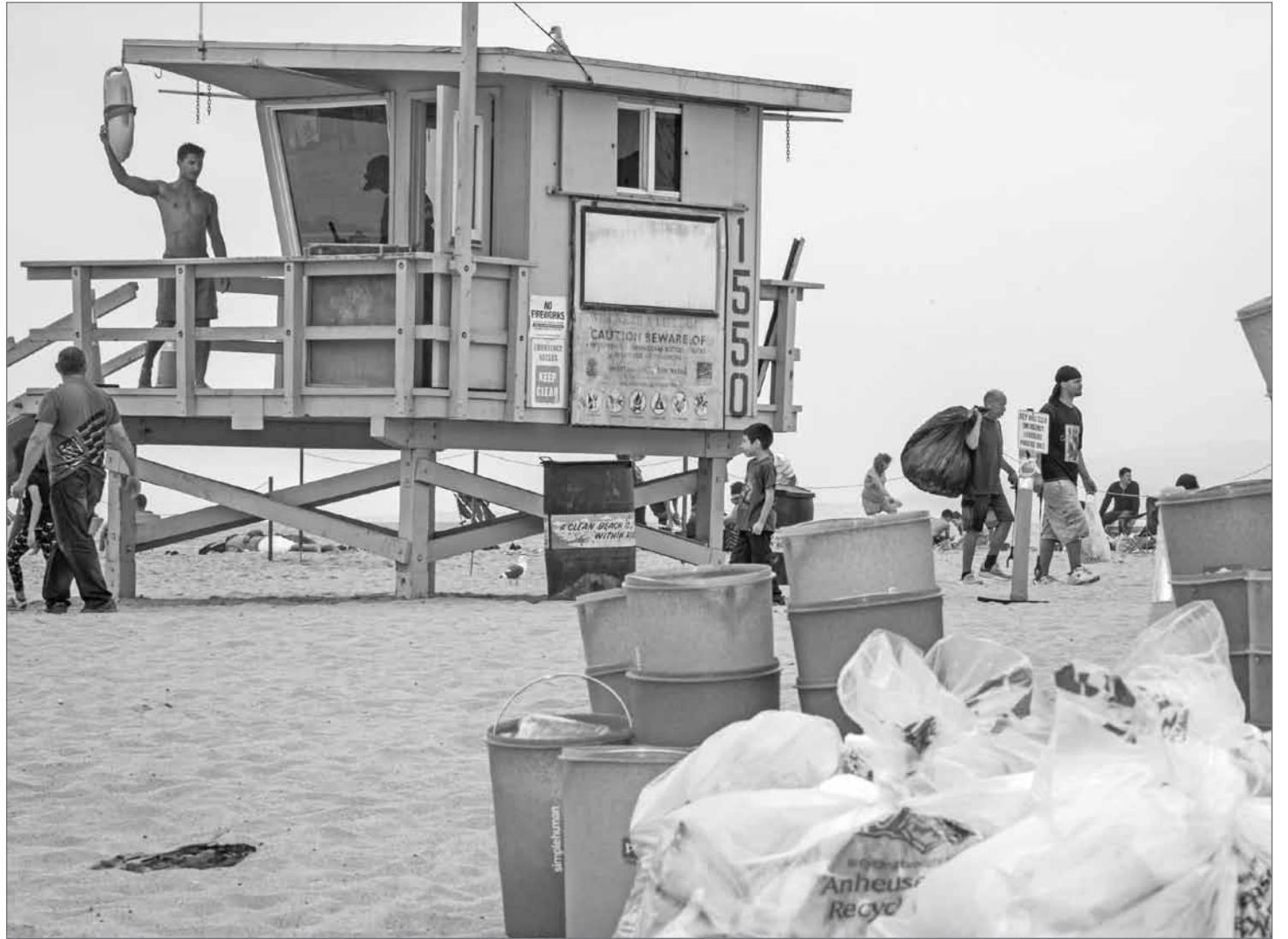
Heal the Bay is calling for volunteers of all ages and physical abilities for the next Coastal Cleanup Day, happening September 19th. No special abilities are necessary. Coastal Cleanup Day participants have collected more than 1 million pounds of trash in Los Angeles County since 1990's inaugural event, equaling roughly the weight of a fully loaded Boeing 747 jumbo jet. Volunteers will work at fifty sites, including Ballona Creek and Arroyo Seco. For more information, visit healthebay.org/ccd