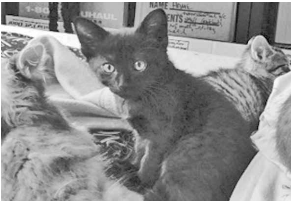
MySin is elegant and intelligent.

Be kind. Save a life. Support animal rescue.