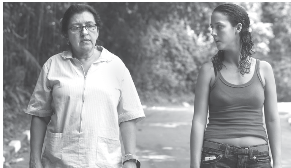
Regina Casé and Camila Márdila in The Second Mother , an Oscilloscope Pictures release.

It must be said, Regina Casé shines in the lead role as Val. She is a graceful presence as an immediately empathetic and cordial character. Val is visibly frustrated by her position – she overthinks how to organize a new coffee table set, is bothered by the family dog, and can't seem to stop Jessica from eating the family's chocolate ice cream. Everybody in The Second Mother seems perpetually frustrated and