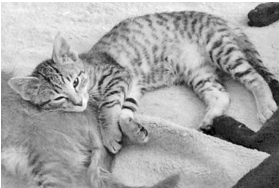
Kiki is looking for a home with another kitty to play with.

Looking for your purr-fect match? Kitties of all colors and sizes are ready for the forever home with you. Mark your calendar now and join us for our 7th Annual Fur Ball, Sunday, October 4, 6 pm. It will be a magical evening, benefitting the forgotten felines of Los Angeles. More information and tickets are at our website, www.kittenrescue.org .