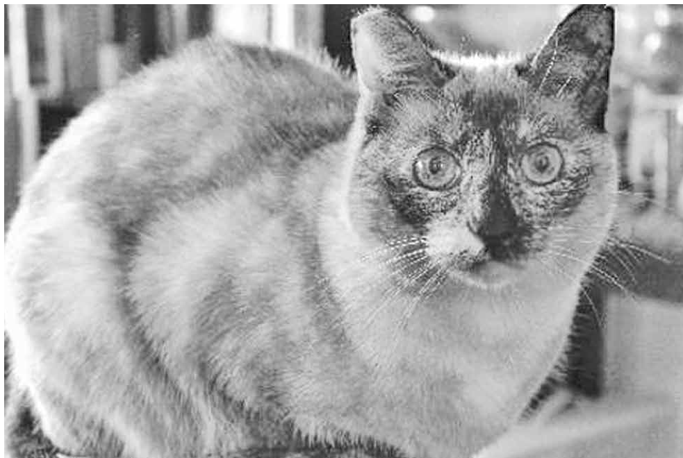
Lena enjoys comfort and security.

his special skills to make biscuits on you when you're lying down, MySin is ready to give you his love.