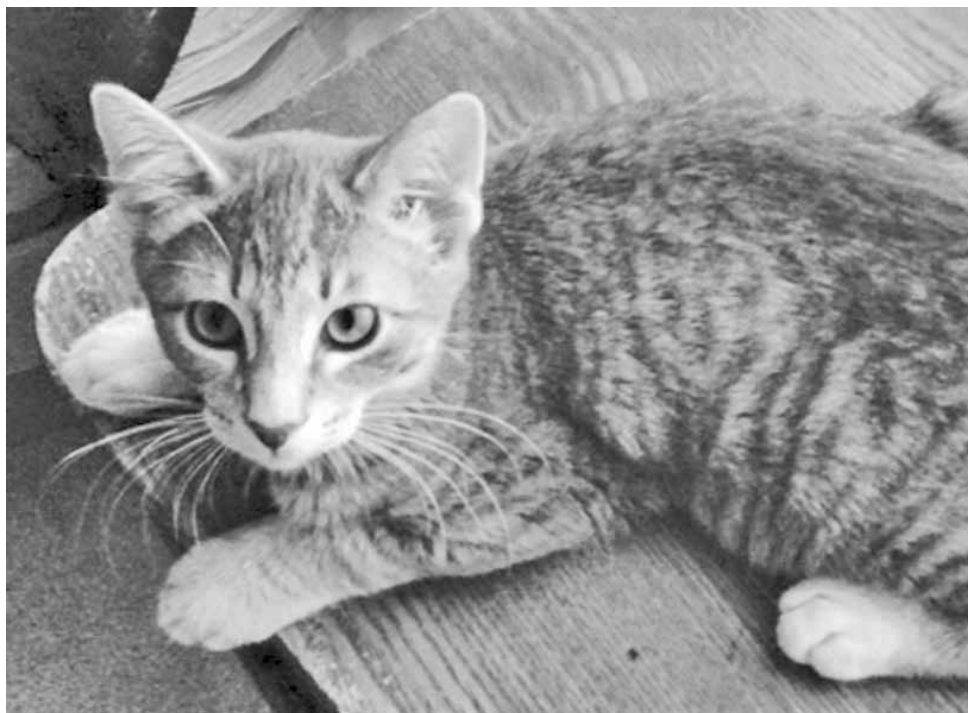
Mac is a good boy who loves to play and snuggle.

gold eyes. He's the quickest, smartest, most daring kitten of his brother and sisters. Do you have a puzzle for him? Like how to climb out of a bathtub when he was a tiny two-week-old? MySin is ahead of those tabbies! Being fostered in a home with two adult cats and his brother and sisters, he loves the company of other kitties and will need another feline playmate in his new home or maybe even a dog. Sometimes MySin is too busy playing to cuddle, but when he's ready for lovin', he'll come up to you, purring like mad. He loves petting and kissing and just adoring you with his bronze-gold gaze. He likes ice in his water bowl, so don't put your glass of ice water down near him because he will try to lick all the ice cubes and steal your straw. Using