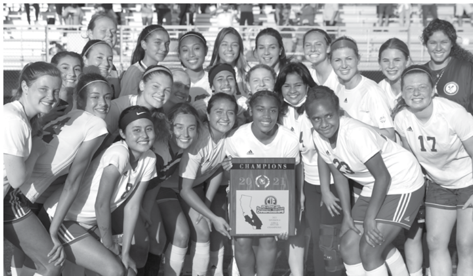
The Eagles celebrate their 2-1 win over San Dimas to win their first CIF Southern Section Championship.

Under normal circumstances, the cross country season would have started in September 2020, with the state meet culminating in late Novem-