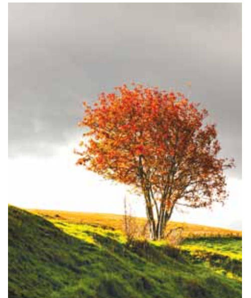
Lumphanan, Scotland—the real King Macbeth met his grisly, headless fate on yonder stone.

We'll watch anything starring Martina Gedeck, but the cooking steals the show. Don't start this one when you're hungry, unless you keep a certified Italian chef handy.