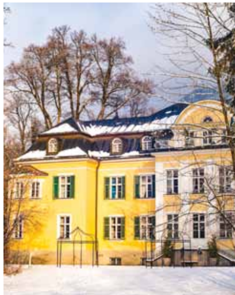
Salzburg, Austria — Maria Augusta Kutschera came as a governess and left with the von Trapp Family Singers.

An American adapts to Bangalore without all the pretension and pseudo-mysticism of some eastern-themed movies. The Indians are thoughtful and lovely, if profit-minded, human