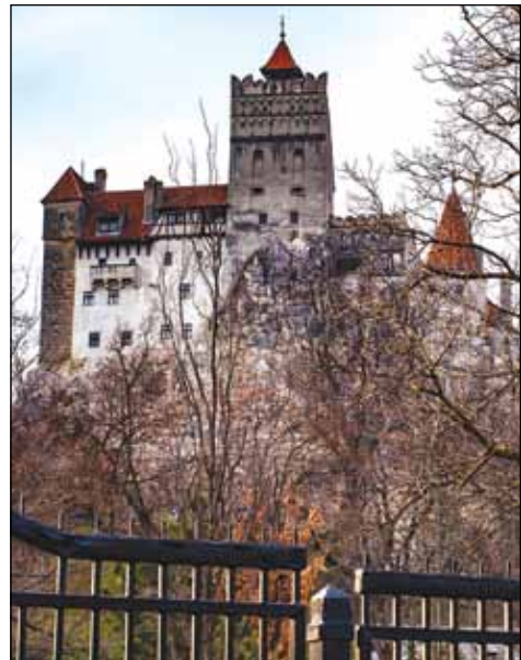
Bran, Romania—Count Dracula opts for photogenic, or at least his castle does.