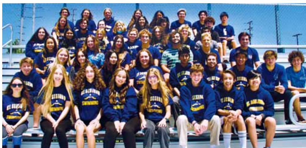
The ESHS swim team had a successful season and sent numerous swimmers to compete at the CIF Southern Section finals.

El Segundo High's Athletic Department had crammed football, basketball, softball, lacrosse, soccer, baseball, swimming, water polo, track and cross country modified seasons into five months when restrictions were stringent. While many other schools experienced fallout from Covid, El Segundo athletes and supporters followed all the guidelines and successfully got through their challenging seasons. •