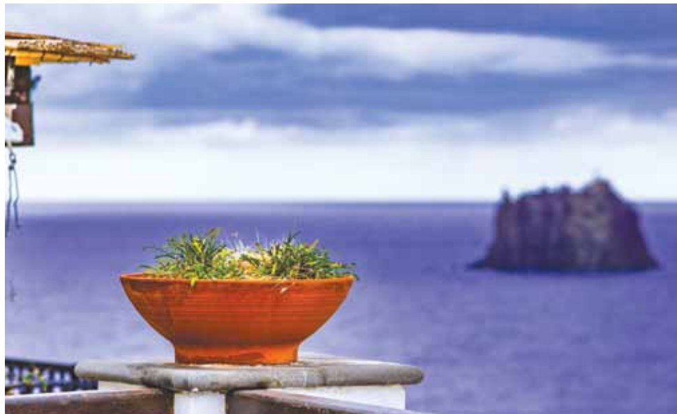
Stromboli, Italy — Ingrid Bergman tested the morals clause in her contract here and lost.

Earnest young Americans puzzle over Span-