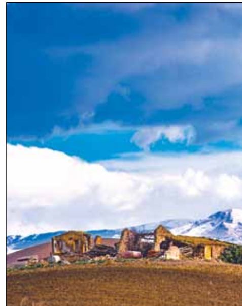
Corleone, Sicily—the road to The Godfather is lined with colorful ruins.