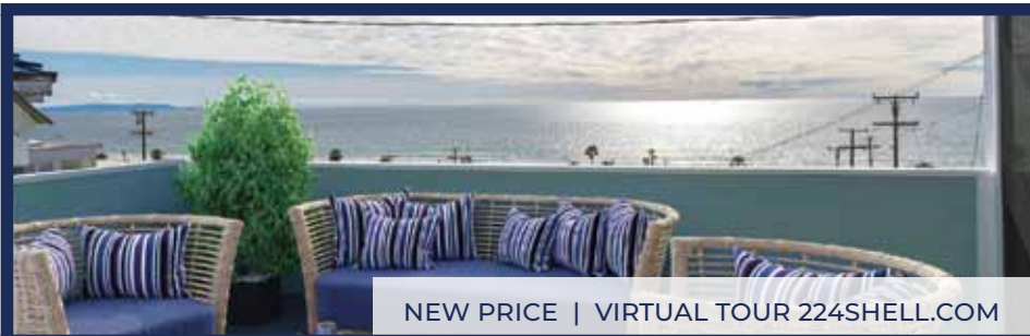
NEW PRICE | VIRTUAL TOUR 224SHELL.COM

DUPLEX WITH UNOBSTRUCTED WHITE WATER VIEWS