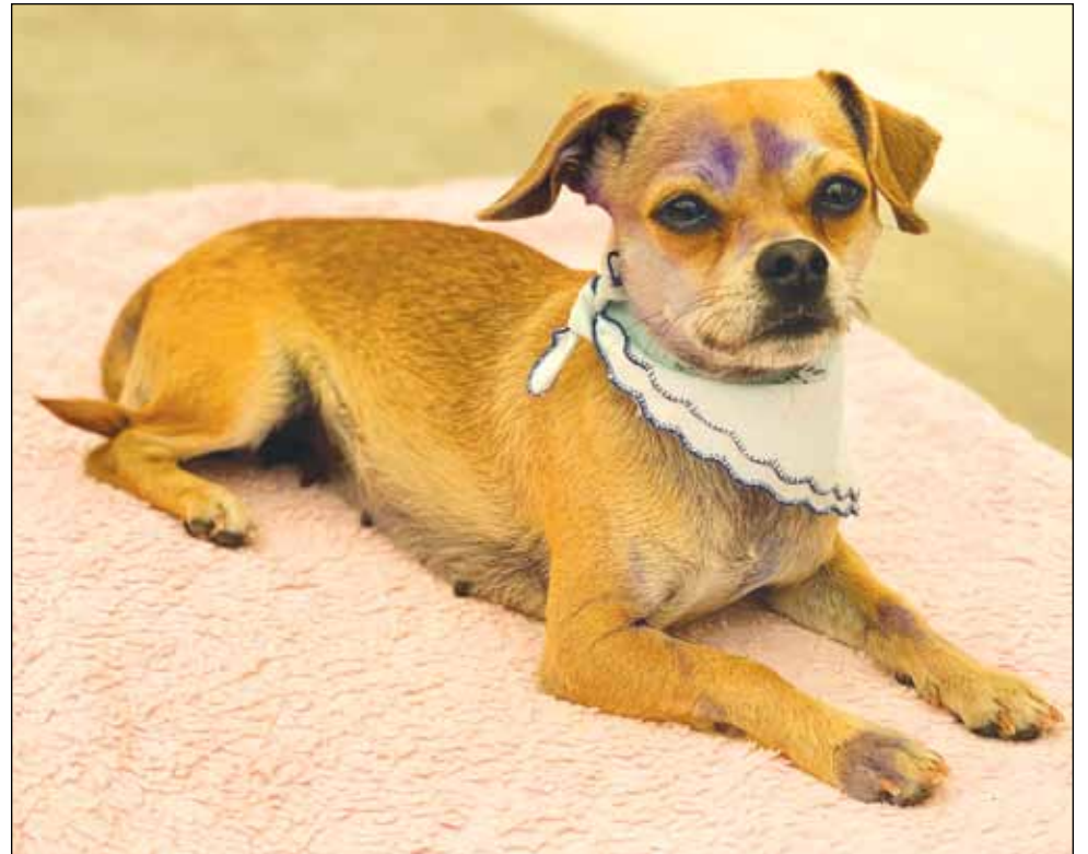
Congratulations to Jacqueline and her new family.

getting a bath and being pampered by our staff; who fell in love with her positive attitude and ability to trust people even after what she had been through. It seems that Jacqueline made an impact on the family who found her as well, they came back to adopt her as soon as she was available! We are so happy for the family, and for Jacqueline. •