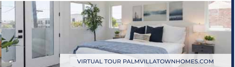
VIRTUAL TOUR PALMVILLATOWNHOMES.COM