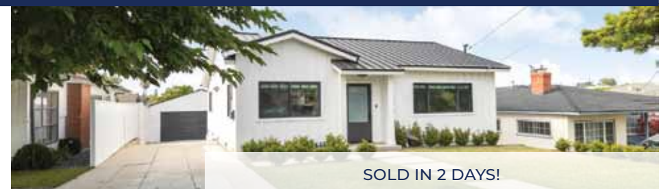
SOLD IN 2 DAYS!

Situated at the top of the hill | Spacious open floor plan | Vaulted ceilings | Pristine white kitchen | Custom cabinets, marble countertops, breakfast bar and state of the art appliances | Large main bedroom with en-suite bathroom | Enclosed shower and marble double sinks | Expansive yard perfect for entertaining