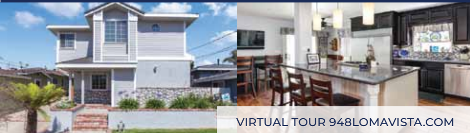
VIRTUAL TOUR 948LOMAVISTA.COM