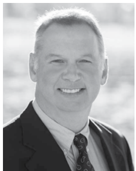
20-year El Segundo Home Owner