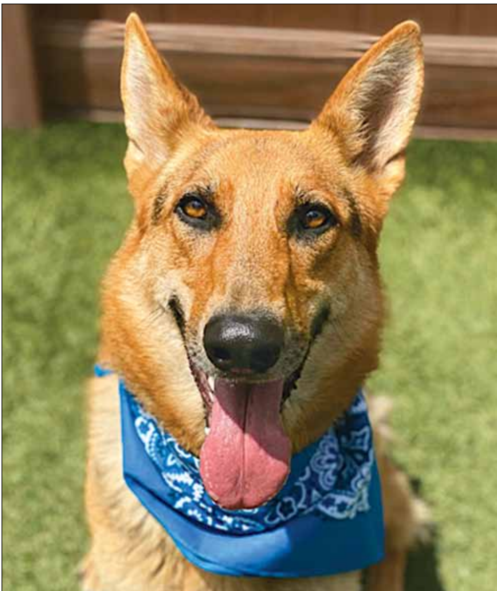
Foxy Lady 20-04116