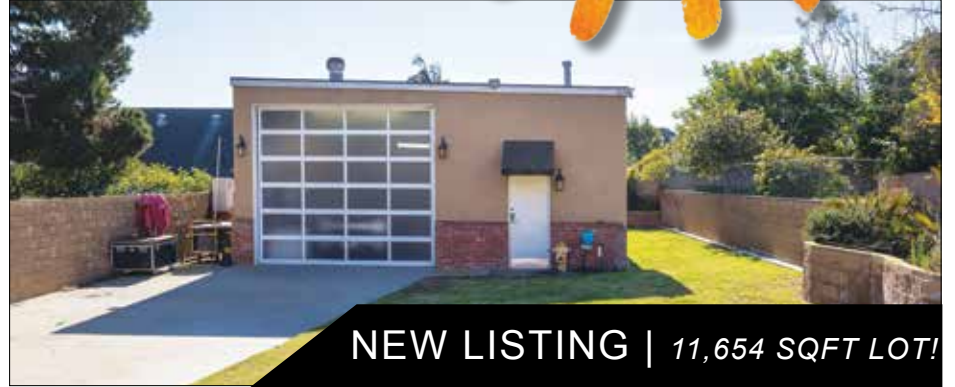
NEW LISTING | 11,654 SQFT LOT!

FREE STANDING TOWNHOME CENTRALLY LOCATED NEAR REC PARK, UNIT HAS APPROX. 1,400 SF. FT. OF SPACE AND A TWO CAR GARAGE.