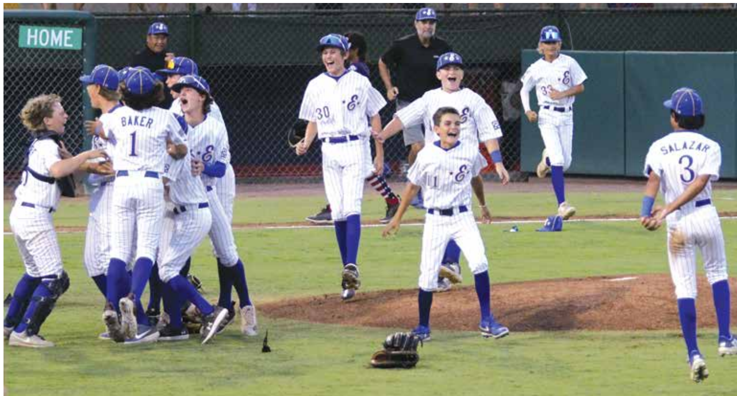
El Segundo celebrates after defeating Northern California champions Bollinger Canyon Little League 3-1 in the West Region finals. El Segundo opens the Little League World Series today at 4 p.m. against New Albany, Ohio the Great Lakes Region champion. See story below.