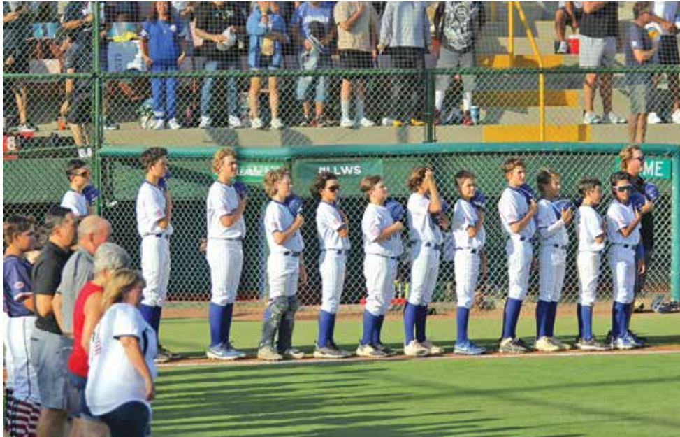
The El Segundo all-stars honor our flag and nation prior to the first pitch of the Little League West Region final.