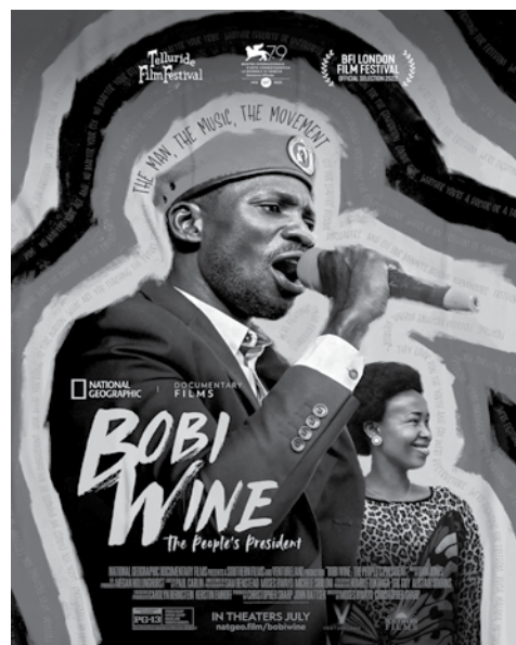
Bobi Wine: The People's President