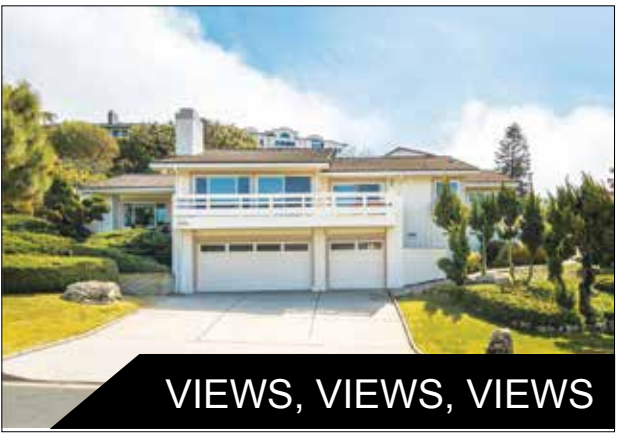
VIEWS, VIEWS, VIEWS

OPEN FLOOR PLAN PLUS DREAM BACKYARD W WATERFALL FOUNTAIN & FIREPIT