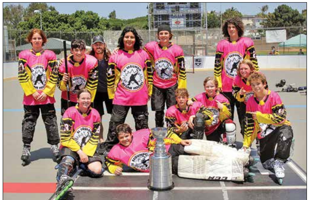
The Pink Lemonade are all smiles after winning the Pee-Wee Division championship.