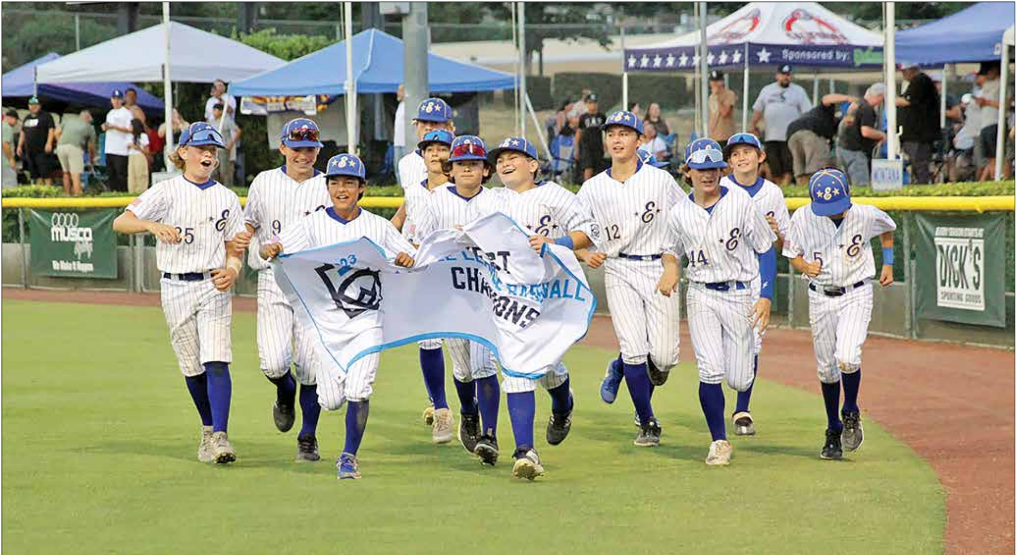
The champions take a lap.