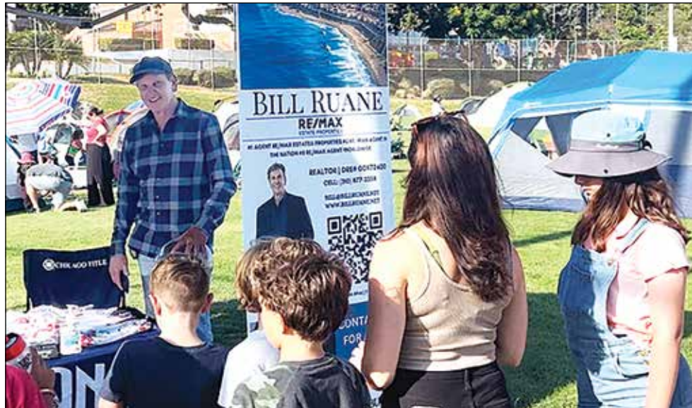
Amazing turnout at the El Segundo Family Campout. Thank you to everyone who participated.