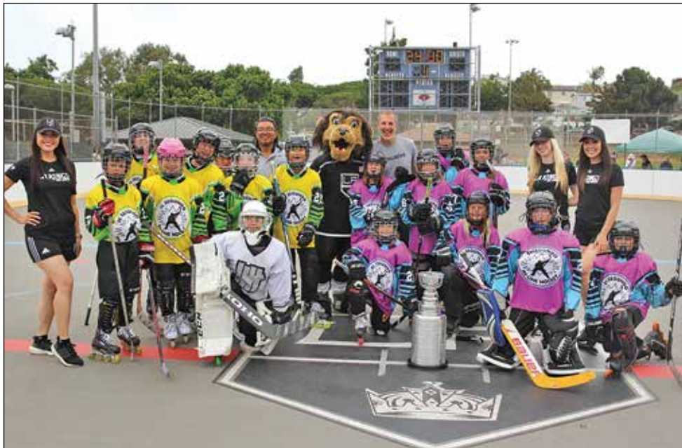
The Koopa Troopas and The Sprites pose with the El Segundo Cup along with LA Kings mascot Bailey and the Ice Crew.