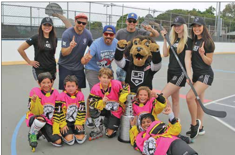
The Hawaiian Punch pose with Bailey and the LA Kings Ice Crew after winning the Mites Division of the ESIHA.