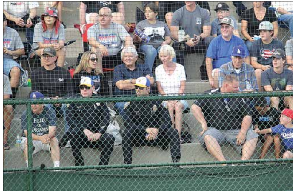
El Segundo PD showed their support and got a standing ovation when they walked in.