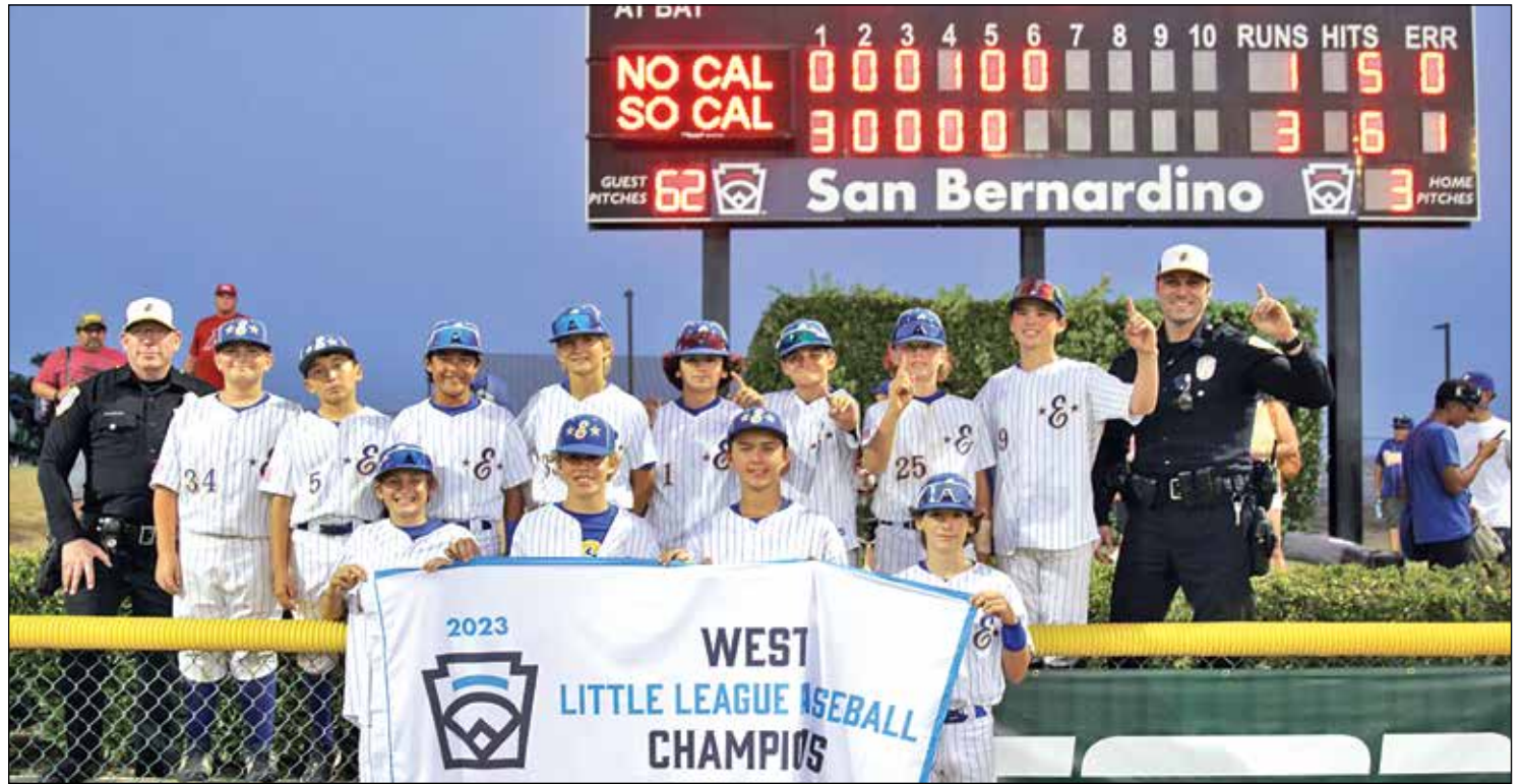
The champions pose with their banner while being flanked by El Segundo's finest.

The ESIHA held their summer championships that included an appearance by Bailey, the Los Angeles Kings mascot, and the LA Kings Ice Crew. The winning teams and their players' names will be inscribed on the perpetual El Segundo Cup trophy in each division. •