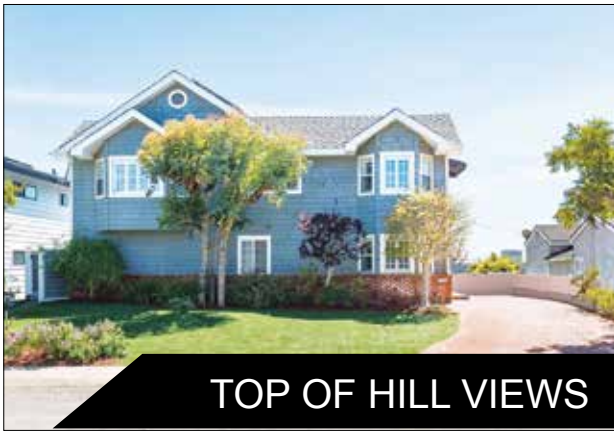
TOP OF HILL VIEWS

SPACIOUS SINGLE LEVEL FLOOR PLAN W PANORAMIC VIEWS OF OCEANS, HILLS, AND CITY