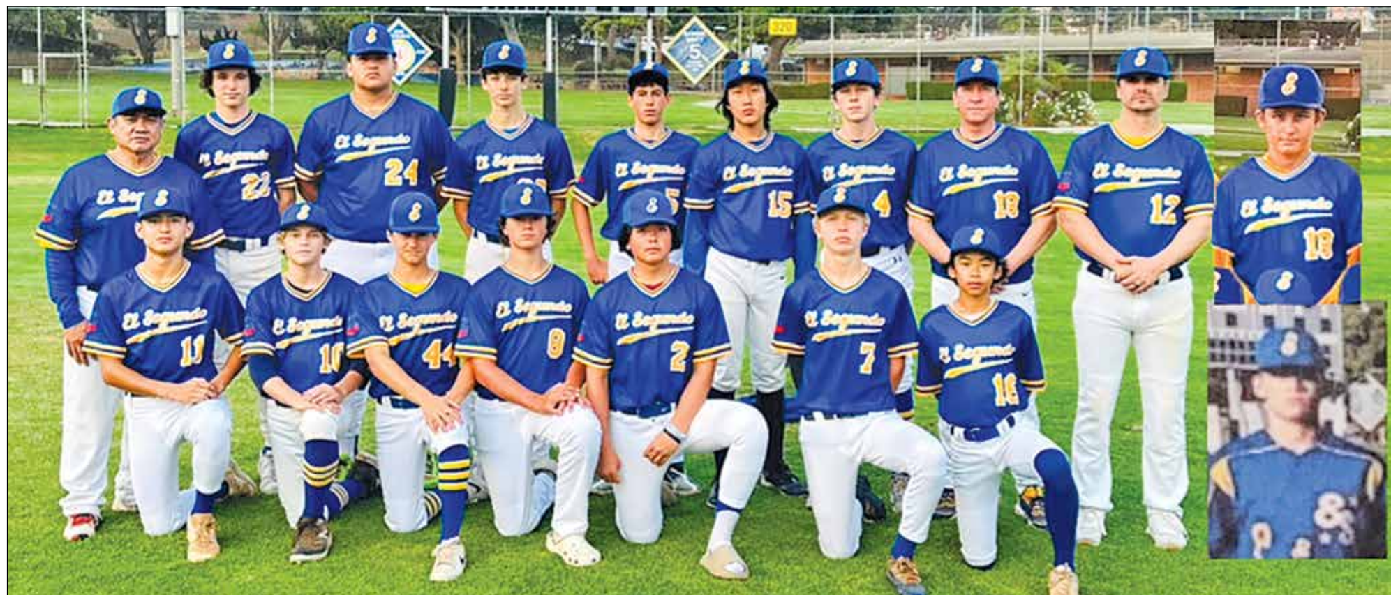
The El Segundo Babe Ruth 14-year-old All-Stars competed at the Pacific Southwest Regional Tournament in Murray, Utah.