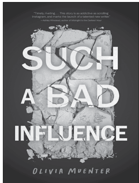
Such a Bad Influence by Olivia Muentzer