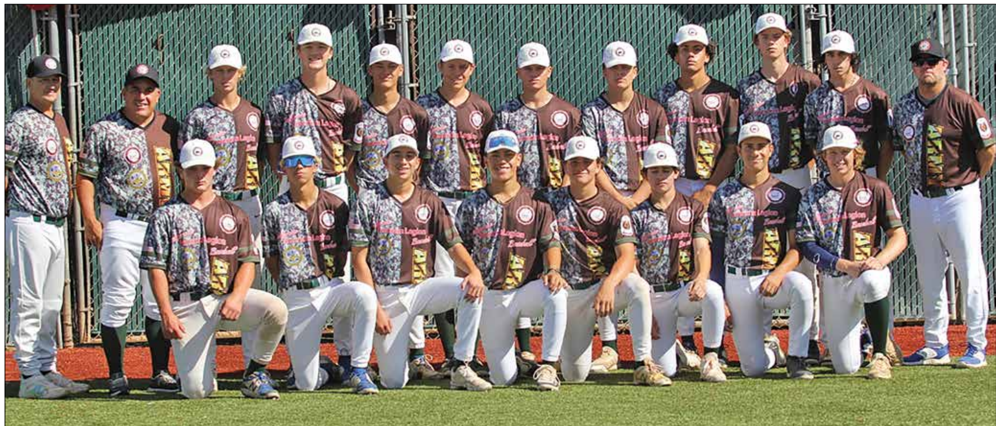
The El Segundo Blues pose before their game against the Clovis Nighthawks in the American Legion State championship game.

This recognition program is based upon comprehensive excellence in the CIF Southern Section athletic competition for both boys' and girls' sports. Its purpose is to enhance the spirit of competition, sportsmanship, and goodwill among student-athletes and CIF schools. •