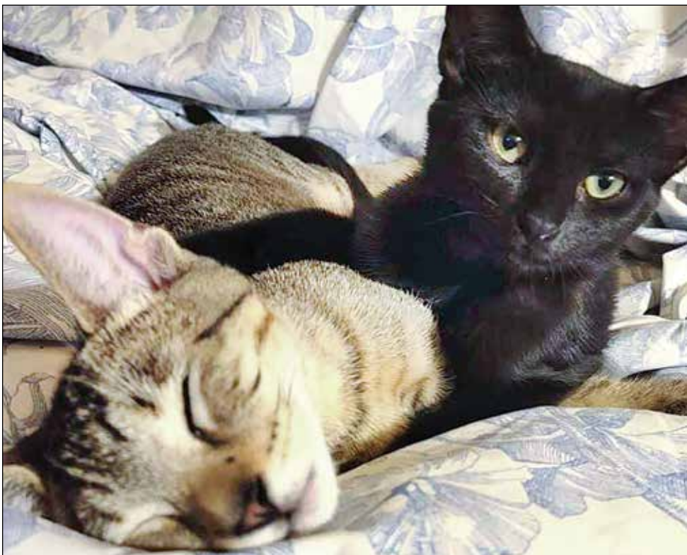
Arthur and Buster

Kitten Rescue rescues cats and kittens from a variety of situations. Most live in our volunteers' homes and those volunteers foster them until we can find permanent homes for them. Young or old, tabby or Siamese, we care for orphaned and abandoned kittens that need to be bottle-fed around the clock, moms with litters, cats that need socialization, and sick or injured animals. When they are finally ready for their forever home, we will help match you with the purr-fect one. When you adopt, you save a life... and in turn enrich your own.