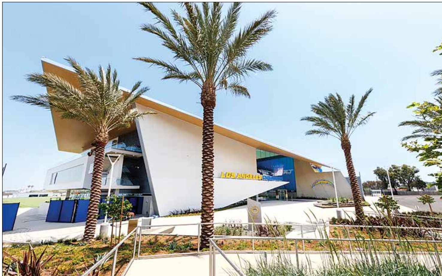
The Los Angeles Chargers have officially opened "The Bolt," the team's new state-of-the-art training facility and corporate headquarters in El Segundo. The Bolt's extraordinary design, technological prowess, prime location and dynamic event space place the building squarely at the intersection of entertainment and professional sports. We are so excited to welcome the Los Angeles Chargers to their new home in El Segundo.