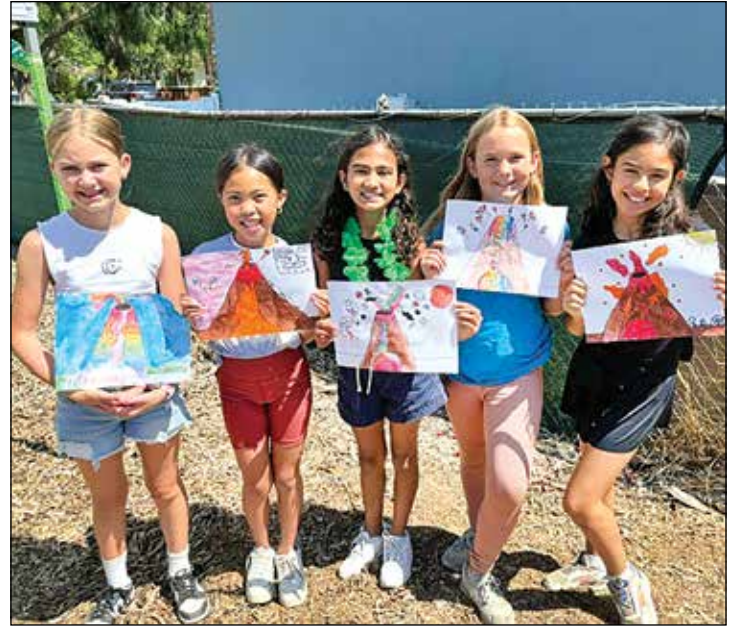
The scouts share images of volcanos