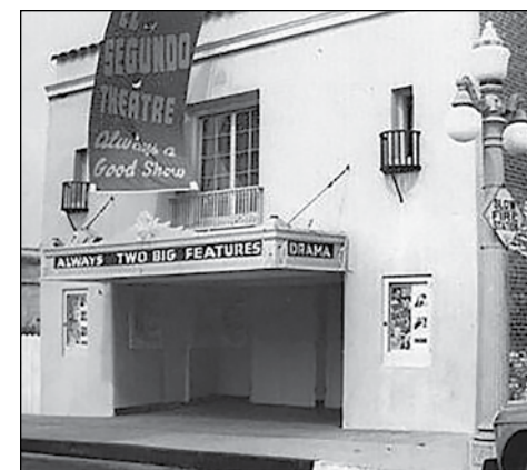
Artwork and inspiration (Left to Right): "Yellow Shadow" by Curtis Green; Old Town Music Hall from the archives.