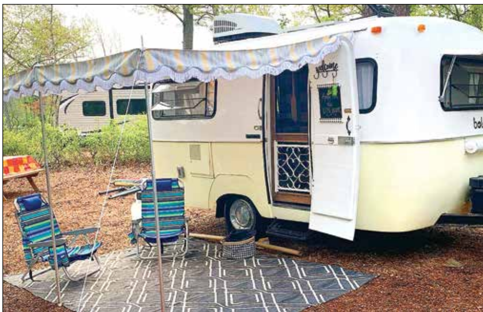
Wanderlust Trailer.