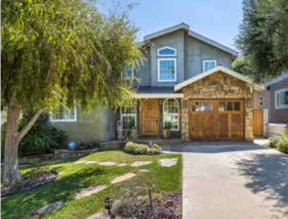
228 MAPLE STREET, EL SEGUNDO 5 BED | 3 BATH | $2,399,000