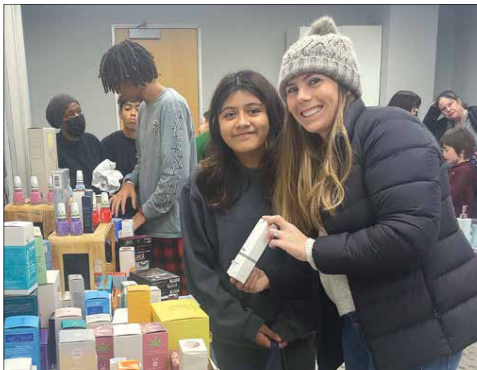
Family members shopping at the Walk with Sally store.