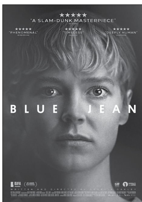
Blue Jean, courtesy Magnolia Pictures.

Distributed by Magnolia Pictures. Now playing in select Los Angeles theaters. •