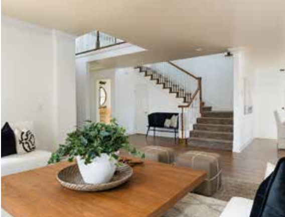
539 W MAPLE AVENUE, EL SEGUNDO 4 BED | 3 BATH | $2,498,000