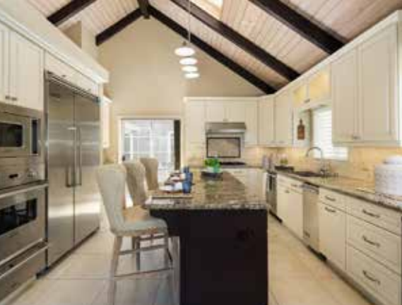
624 SIERRA STREET, EL SEGUNDO 5 BED | 4 BATH | $2,998,000

CALL TODAY TO RECEIVE THE MOST ACCURATE ASSESSMENT OF YOUR PROPERTY'S VALUE, PROVIDED TO YOU AS A COMPLIMENTARY SERVICE BY BILL RUANE