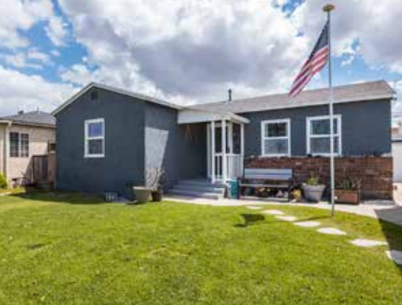
18902 DOTY AVENUE, TORRANCE 3 BED | 2 BATH | $899,000