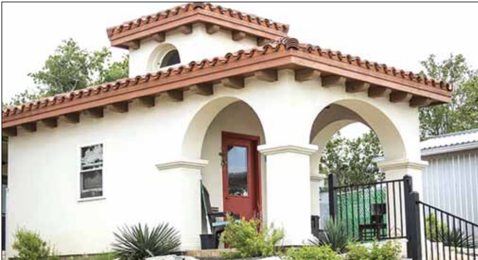
Another example of a tiny home located in the Community First! Village in Texas.

Having been a featured speaker at the UN, writing a book, and continuing to learn every day, Robert Strock hopes to speak soon with governor Newsom and mayor Garcetti about solutions to the current growing crisis. Homelessness is a complicated and deeply human issue requiring more education and reading than one article can provide. •