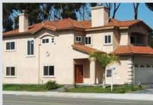
12202 S. LA CIENEGA BLVD. HAWTHORNE