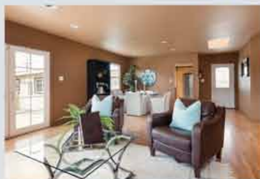
16015 VAN NESS AVE. TORRANCE