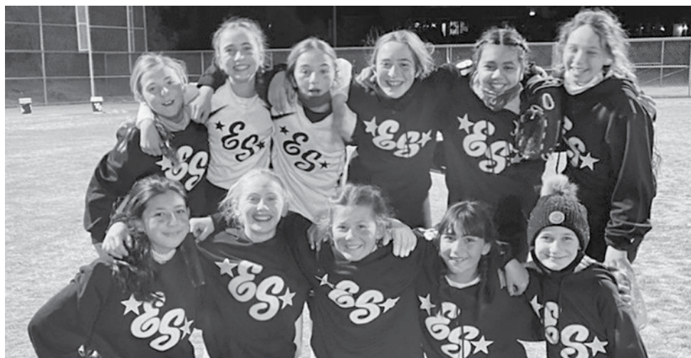
The Eagles Softball Team