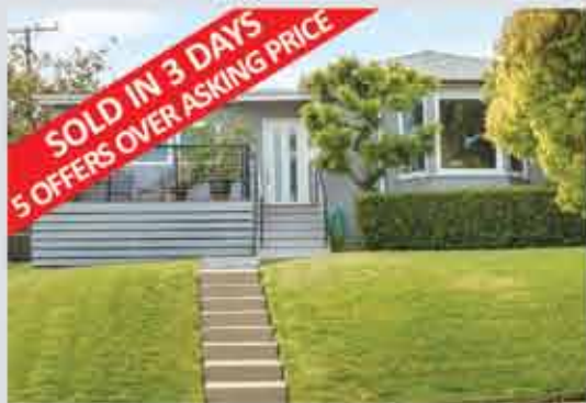
801 BUNGALOW DR. EL SEGUNDO

GIVE US A CALL TODAY FOR A FREE MARKET EVALUATION!