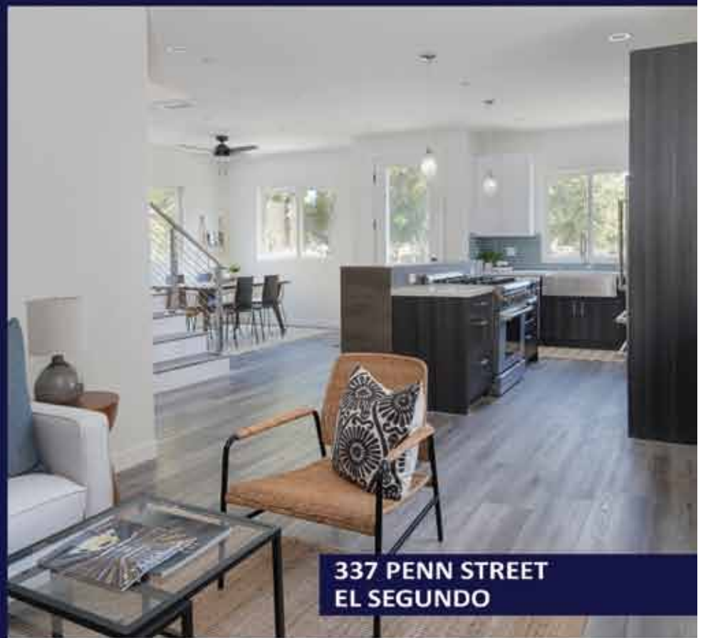
337 PENN STREET EL SEGUNDO