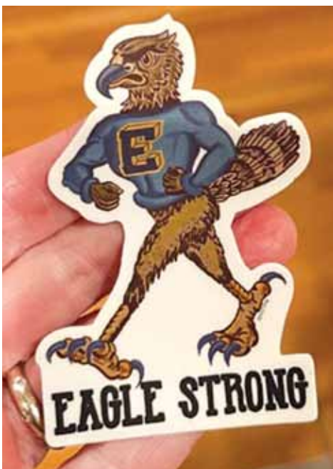
Elmer the Eagle Sticker.