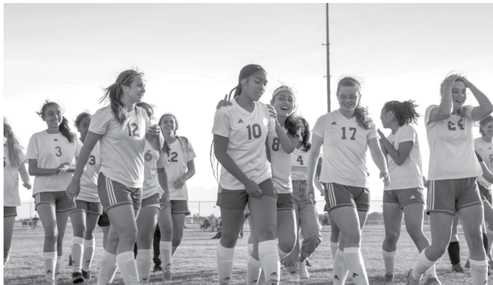
The Eagles celebrate their 3-2 overtime win over Granite Hills in the first round of the CIF-SS playoffs.