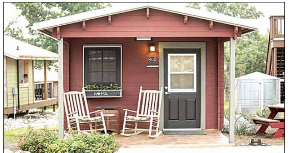
An example of a home in a newly housed community like Strock proposes, located in Austin, TX.