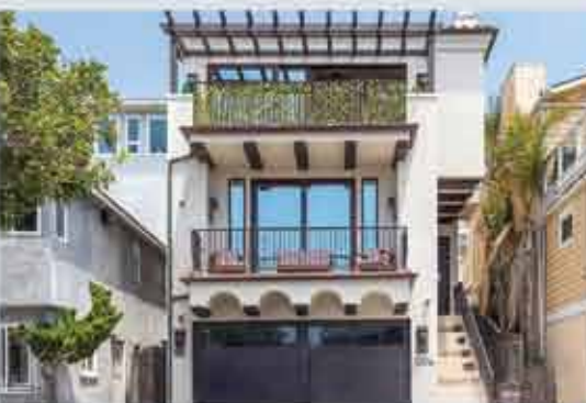
1704 HIGHLAND AVE. MANHATTAN BEACH