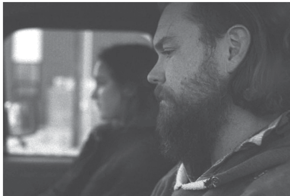
The Killing of Two Lovers , courtesy NEON.

For as much as The Killing of Two Lovers feels like a never-ending upward swing of emotional chaos, ultimately and unfortunately, it is met with a lackluster ending. After investing an hour and a half into this messy and complicated family, I was hoping for an ending that fit the bill. But that's life—unpredictable and sometimes: disappointing. While it wasn't as hard-hitting or