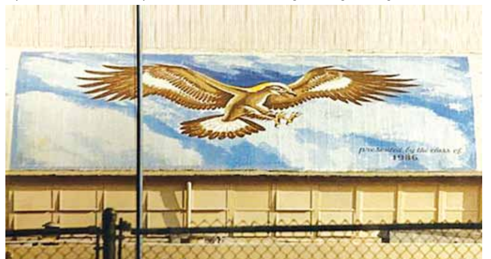
Elmer the Eagle.

Landreth, a gifted artist who was a sign and house painter by trade and passed away in 2010, also completed a second large mural on the roof of one of the campus gyms, some say twice, which was viewable by those jet setters descending onto the LAX airport landing strip.