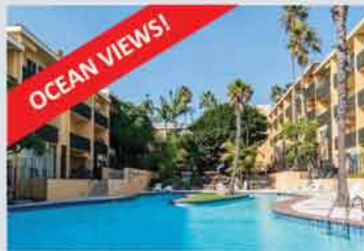
770 W. IMPERIAL #49 EL SEGUNDO