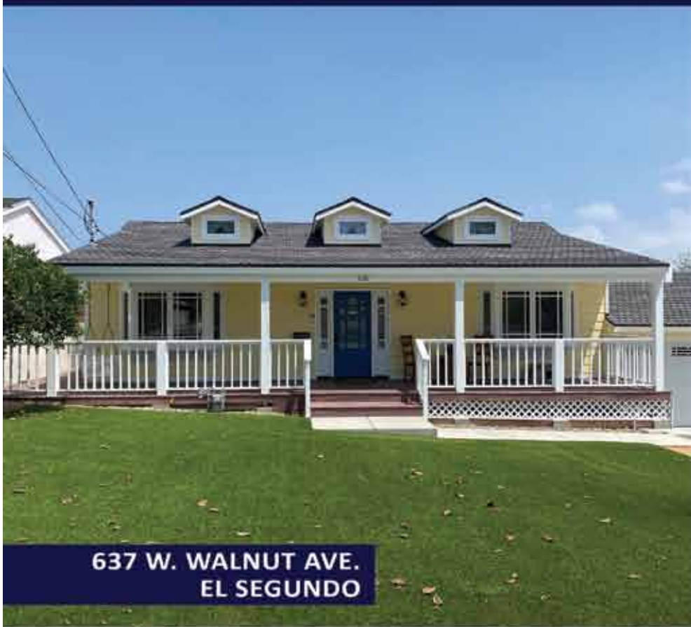
637 W. WALNUT AVE. EL SEGUNDO

#1 AGENT IN EL SEGUNDO • #2 RE/MAX AGENT IN THE NATION • #3 RE/MAX AGENT WORLDWIDE