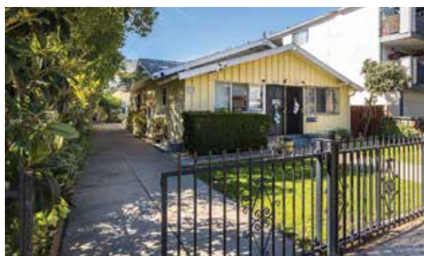
807 GAVIOTA AVENUE, LONG BEACH 5-PLEX | $1,050,000