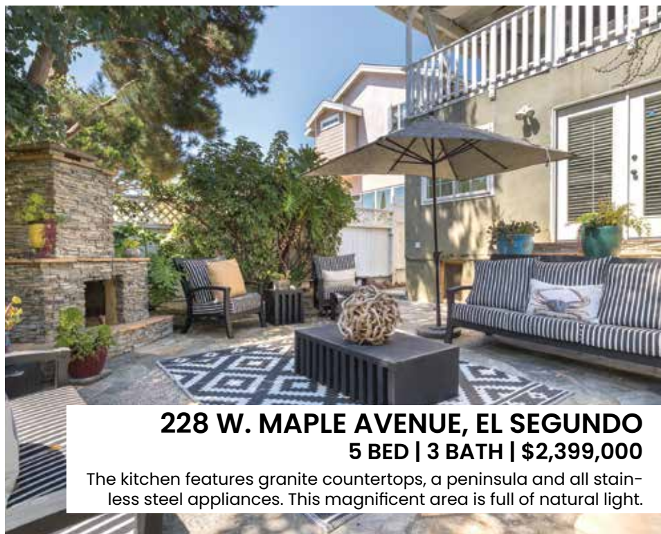
228 W. MAPLE AVENUE, EL SEGUNDO 5 BED | 3 BATH | $2,399,000

The remodeled kitchen features a sizable island, Wolf appliances, barstool seating and plenty of cabinet space.