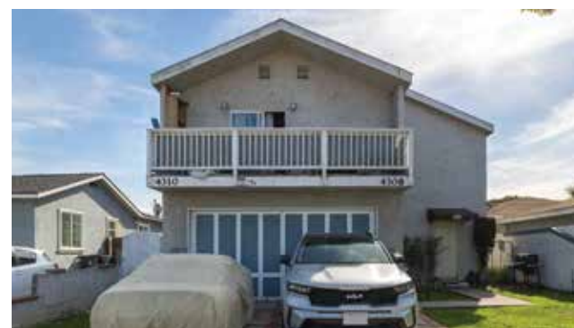
4308 - 4310 W. 159TH STREET, LAWDALE 2 ON A LOT | $1,150,000