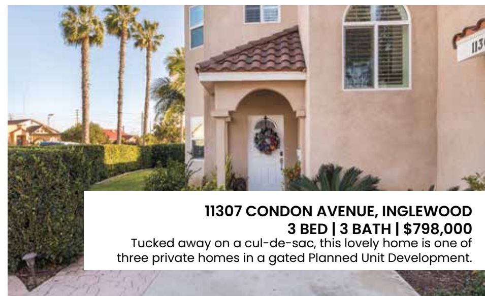
11307 CONDON AVENUE, INGLEWOOD 3 BED | 3 BATH | $798,000

Tucked away on a cul-de-sac, this lovely home is one of three private homes in a gated Planned Unit Development.