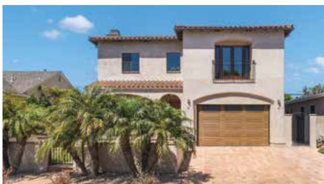
7947 STEWART AVENUE, LOS ANGELES 5 BED | 5.5 BATH

Tucked away on a cul-de-sac, this lovely home is one of three private homes in a gated Planned Unit Development.