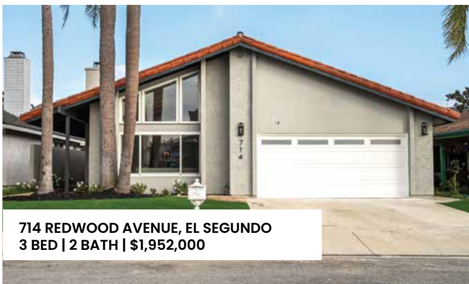
714 REDWOOD AVENUE, EL SEGUNDO 3 BED | 2 BATH | $1,952,000

The kitchen features granite countertops, a peninsula and all stainless steel appliances. This magnificent area is full of natural light.