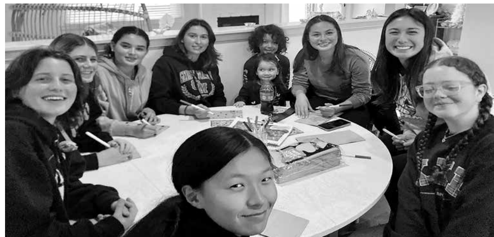
Members of the El Segundo high school's girl's lacrosse team decorate bags in connection with their community service.