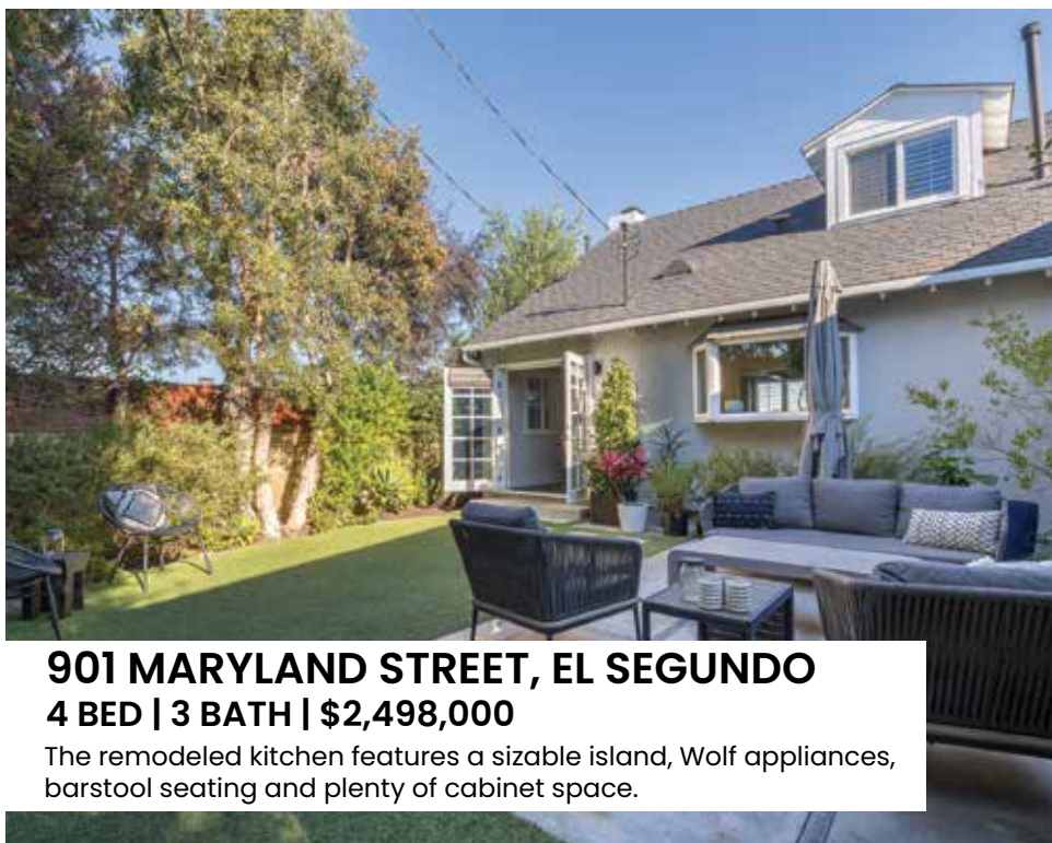
901 MARYLAND STREET, EL SEGUNDO 4 BED | 3 BATH | $2,498,000

The remodeled kitchen features a sizable island, Wolf appliances, barstool seating and plenty of cabinet space.