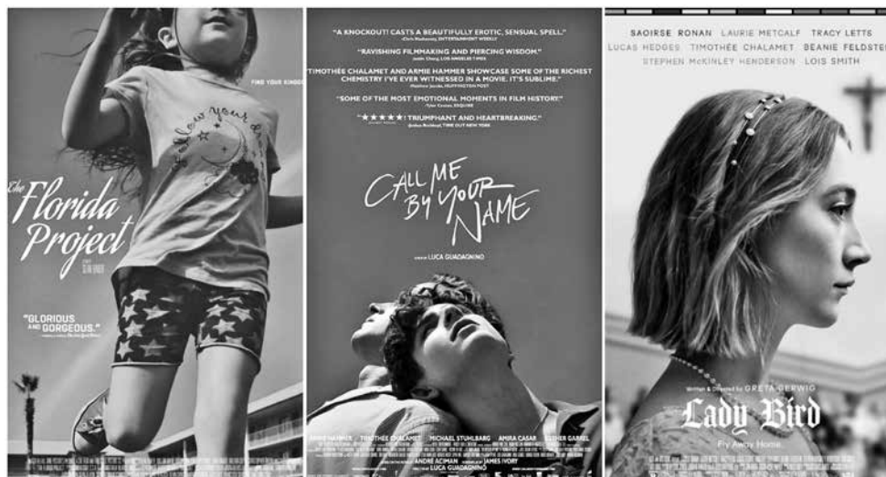
The Florida Project (A24), Call Me By Your Name (Sony Pictures Classics), and Lady Bird (A24).