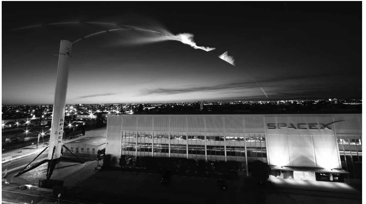
No, it wasn't a UFO. The white plume seen streaking across Southland skies the evening of Friday, December 22 came courtesy of the Hawthorne-based SpaceX, which launched a Falcon 9 rocket from Vandenberg Air Force Base. The dazzling visuals spurred many to pull out their phones to take a photo or video. This view shows the rocket's flight trail from above the company's local headquarters.