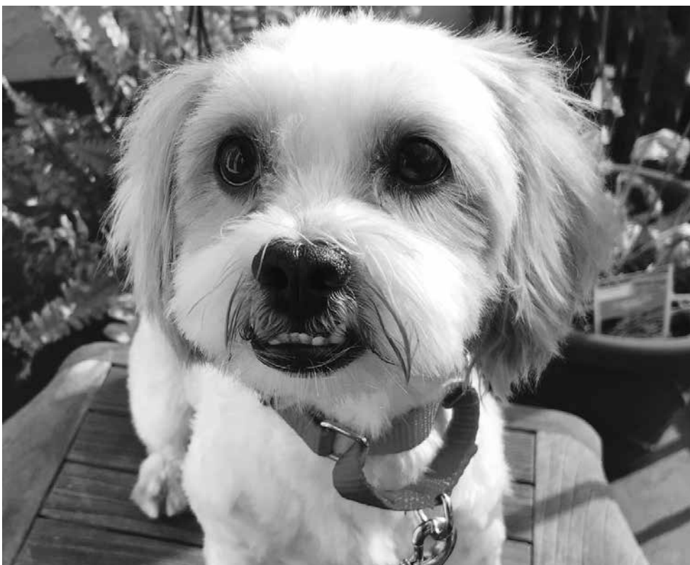
Congratulations to Beanie and his new family.

Beanie is the little Shih-Tzu mix that required four surgeries over the course of two months to totally remove all of the foxtails he had. His folks had previously adopted MSFR's Timmy, a tiny poodle mix, in 2006 but sadly he passed away a couple of months ago from kidney cancer. Their little five-year old female Maltipo (Maltese/Poodle mix) named Pixie missed Timmy and everyone was so lonely and