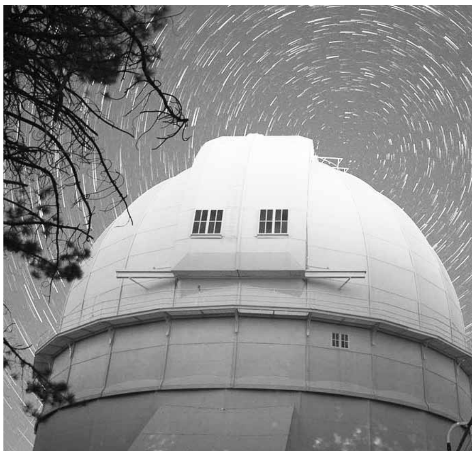
Mount Wilson Observatory

From dark to 10 p.m., assuming the weather permits, the 100-inch telescope will be open to the public for free viewing. The telescope will be pointed at different objects during this time, so visitors can file in and take a peek through the famous telescope that Edwin Hubble used to