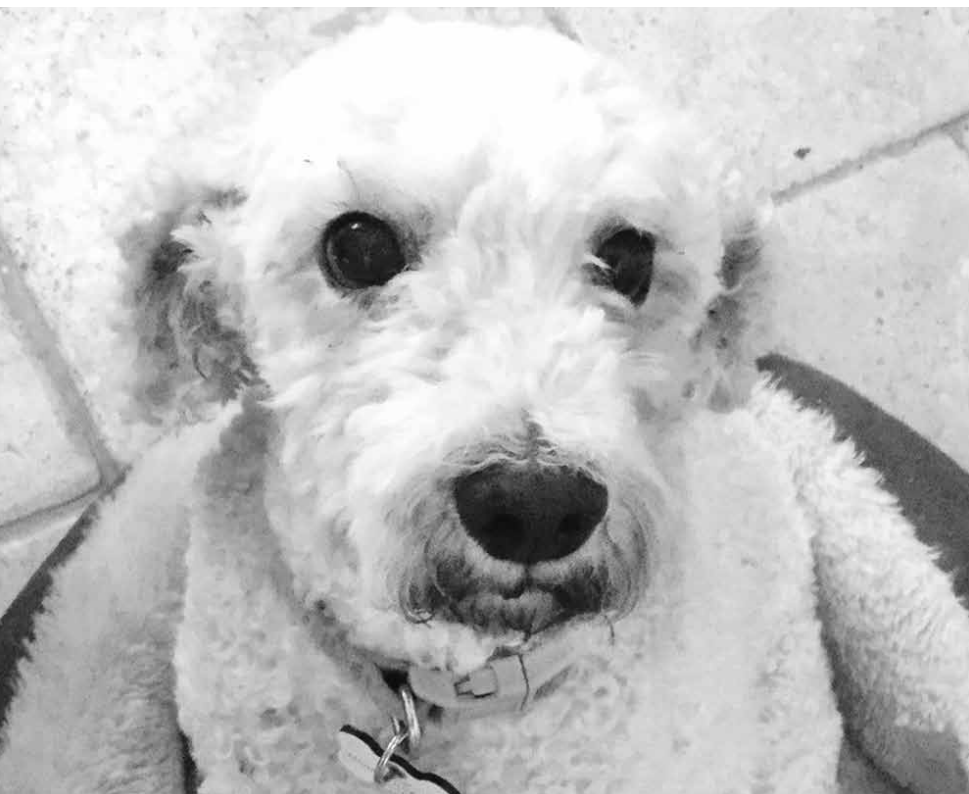
Congrats to Nana and her new family!

Congratulations to Nana , our exceptionally sweet and loving eight-year old Poodle mix, and her new family. Her adopters, who are no strangers to us, have been taking in rescues for about 15 years. They have adopted two dogs from an organization we worked with in the pre-MSFR days and they have also adopted a MSFR rescue. In fact, Nana's mom was even a volunteer