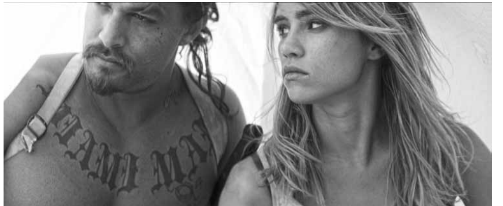
Jason Momoa and Suki Waterhouse in The Bad Batch .