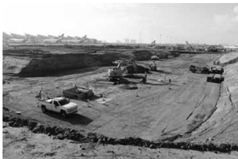
The LAX modernization project started in 2009 and the work is expected to last through 2023, creating more than 120,000 construction jobs per year.

Contractors kept employees on the job longer because firms couldn't find enough skilled and qualified people for their projects, according to the building trade association's economist. But, more projects such as the newly announced Inglewood arena for the Clippers would make the labor shortage even