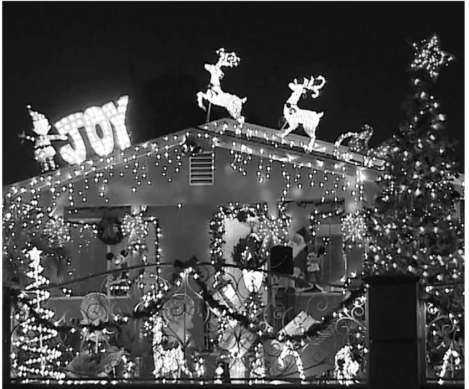
The Holiday Home Decorating Contest was open to all Hawthorne residents last month and inspired many in town to spruce up their homes. Judges came out to check out the entries and ultimately presented awards to the top three. This photo shows the first place winner home at 4221 W. 139th Street.