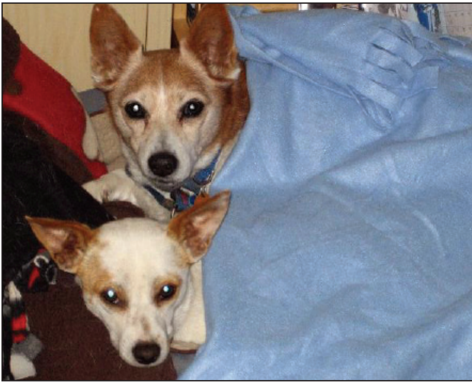
Sawyer living it up in Manhattan Beach.