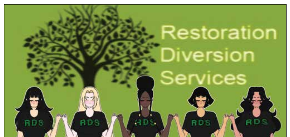
Restoration Diversion Services.