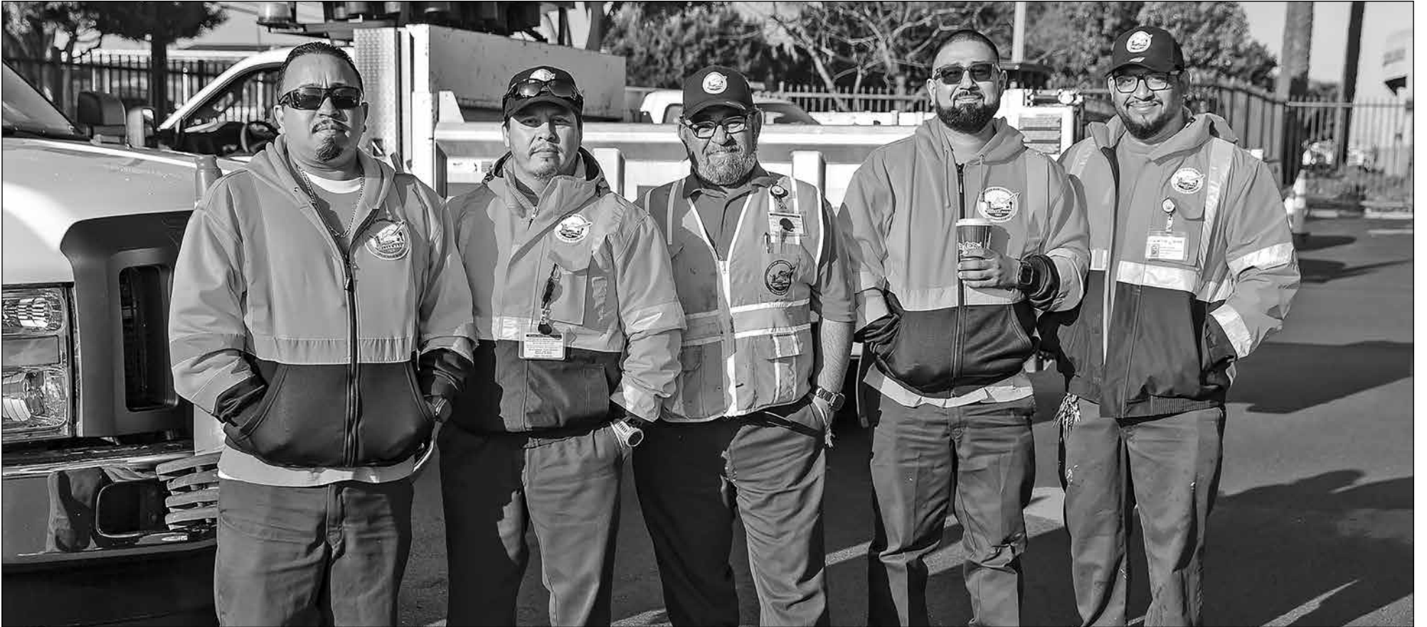
The City of Hawthorne, in collaboration with Republic Services and Martinez Landscape, held a Community Clean-Up event on Saturday, March 15th. Volunteers came to the Betty Ainsworth Sports Center parking lot to gather equipment and get into groups before being sent to various locations around the community to help pick up trash and bulky items to help clean up our community. The City of Hawthorne holds two community clean-up events every year. Thank you to all that came out to volunteer.