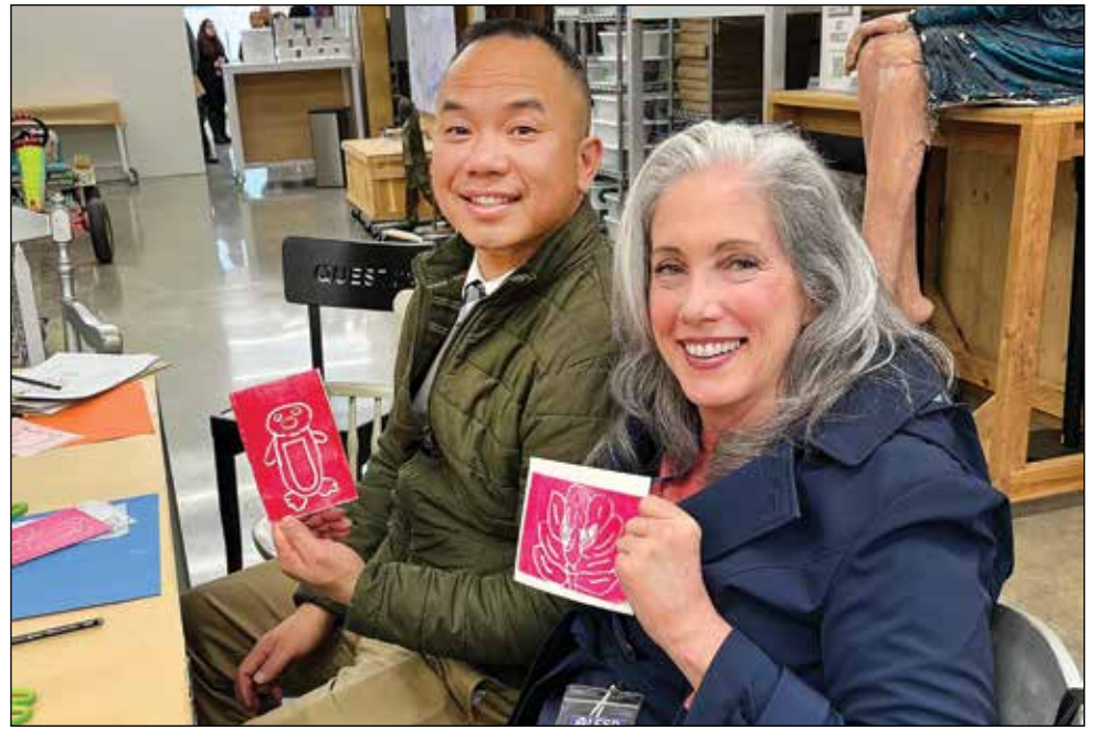
Our district leadership had the privilege of visiting ESMoA, where they took in the incredible exhibit and learned about the impactful work they do. We are deeply grateful for our partnership and the enriching experiences they bring to our LESD schools.