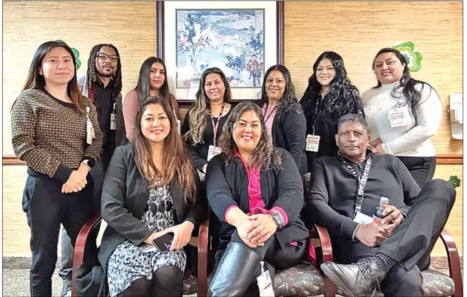
Last week, we honored the unsung heroes of healthcare, our Human Resources teams. From recruitment to training, employee relations, compensation, and compliance, HR plays a vital role in supporting and developing our most valuable asset: our people. Let's recognize their hard work and dedication.