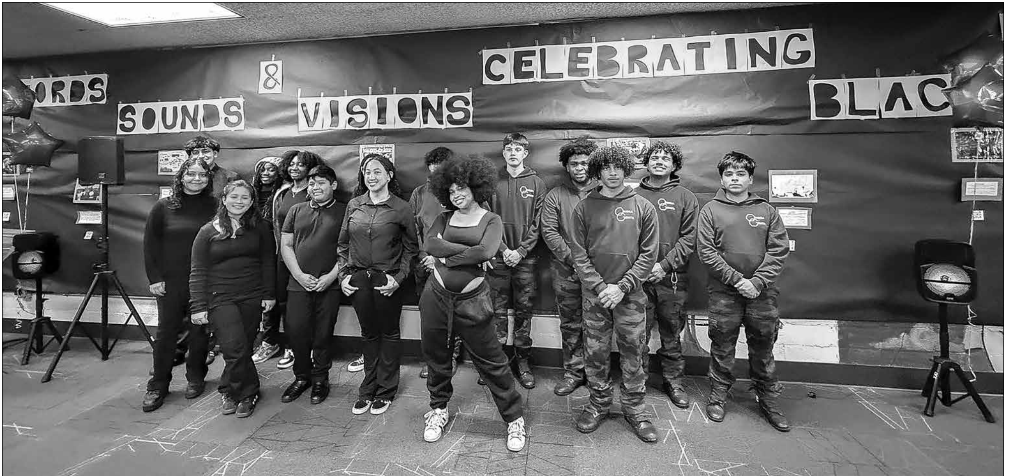
South Bay Workforce Investment Board's Inglewood Teen Center celebrated Black History Month with performances on Tuesday, February 25th. The event was attended by civic leaders, educators, family members and students and performers.

With the theme of "Words, Sounds & Visions Celebrating Black Creativity", the Inglewood Teen Center (ITC) welcomed the community to its annual program highlighting Black History Month, February 25 th , at the center located within the Inglewood Public Library. Established more than 10 years ago, the ITC is sponsored by the South Bay Workforce Investment Board (SBWIB).