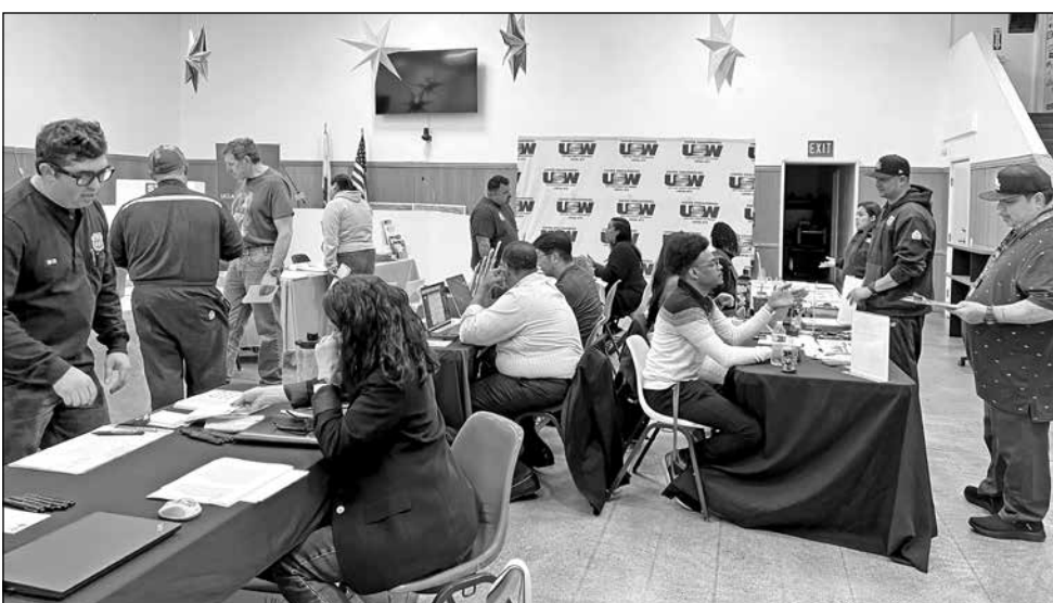
South Bay Workforce Investment Board and Los Angeles City EWDD host resource fair to support Phillips 66 employees affected by refinery closure. The resource fair was held at the United Steel Workers union hall on Friday, February 28th.