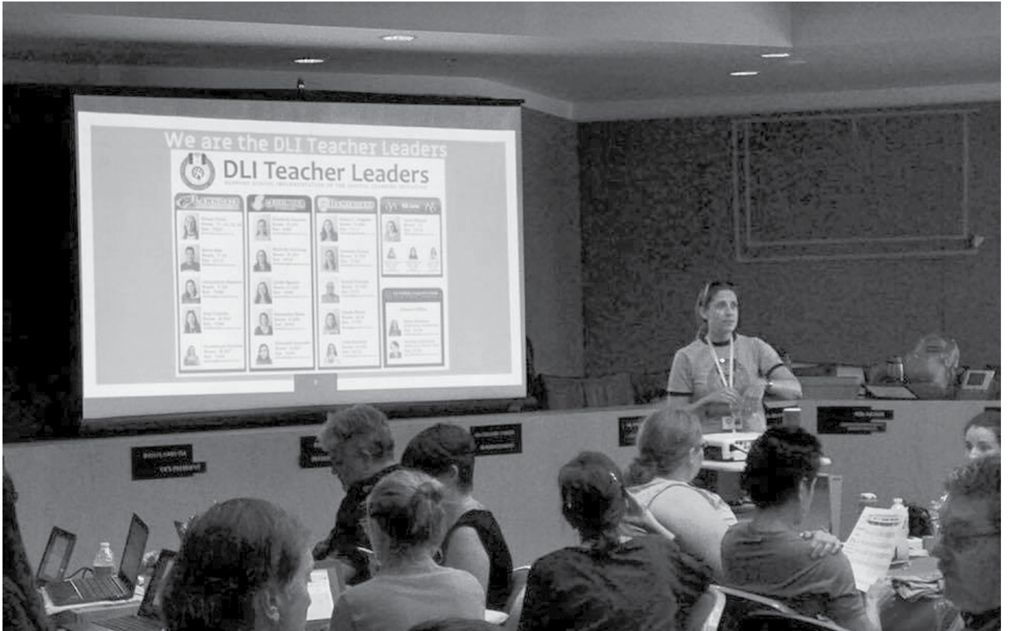
First day of Centinela Valley Union High School District's second DLI (Digital Learning Initiative) 1:1 Teacher Academy was a huge success. An additional 60-plus teachers have volunteered to expand their professional repertoire so they can effectively use technology in the classroom.