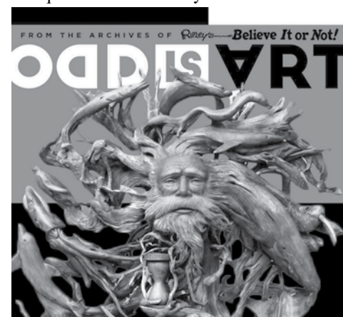
Odd is Art by Ripley's Believe It or Not!

of matchsticks. Fantastical photographs adorn the pages with descriptions of methods and a few short essays of featured artists and art. Not all is odd -- some are breathtaking. There is a sculpture made from scavenged driftwood from the coast of Florida, images made by a flat-bed scanner that look exactly like astrophotography, and ceramics that could easily be mistaken for carvings made of wood. Pieces that are wildly creative are pictured in page after page. And there are the odd ones: