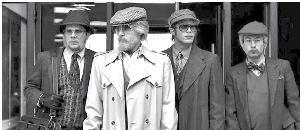
American Animals