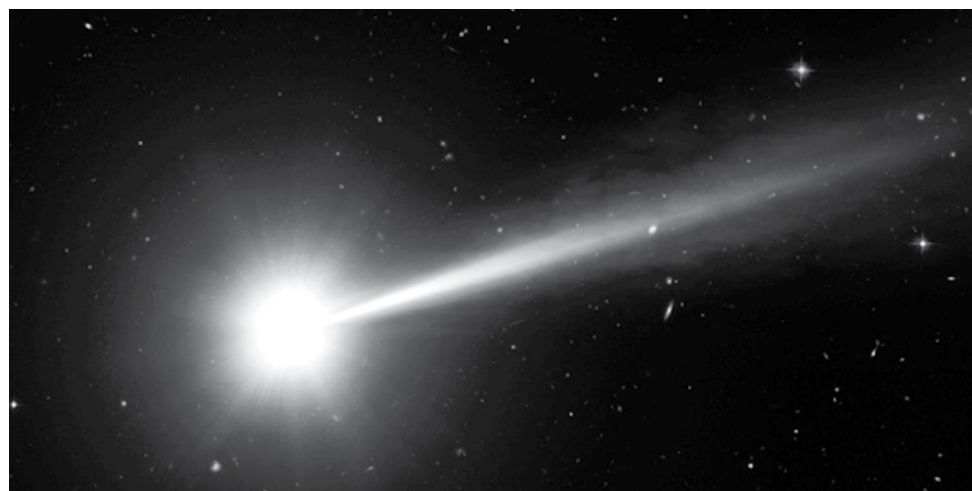
The quasar dates back to less than one billion years after the big bang.

In the fraction of a second before each entangled photon reached its detector,