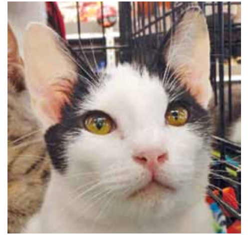
Moses loves to hang out with his brother Micha or playing with others.

Micha and Moses are adorable five-month-old brothers. Micha is a goofy, playful boy who loves to explore. He is the leader and super adventurous. Micha loves to play with any toy he can get his paws on and loves other cats. Moses is a bit more laid back than his brother, letting Micha take the lead. Since they live with small dogs as well, Micha and Moses would be great in just about any home.