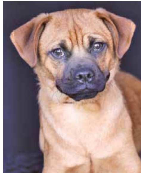
Gracie is a growing girl who loves to play, play, play.

To learn more about these and other wonderful dogs, visit our website at www.animalsrule.org . If a dog is on our website, it's available. Come to our Saturday adoption events from 11 a.m. – 3 p.m. at 305 North Harbor Blvd., San Pedro (just off the 110 near the cruise port). We are always in need of donations for veterinarian bills and our senior dogs. Donations can be made through our website or by sending a check payable to: Animals Rule Placement Foundation at 305 North Harbor Blvd., San Pedro, CA 90731. All donations are tax-deductible; we are a registered 501©3 non-profit organization. •