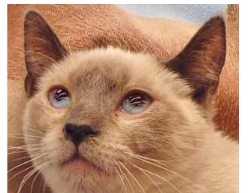
Suki is looking to be adopted with a companion.

On Saturdays, we have adoptions from noon to 3:30 p.m. in Westchester at 8655 Lincoln Blvd. just south of Manchester Ave. and also in Mar Vista at 3860 Centinela Ave. just south of Venice Boulevard. Our website lists additional adoption sites and directions to each location. •