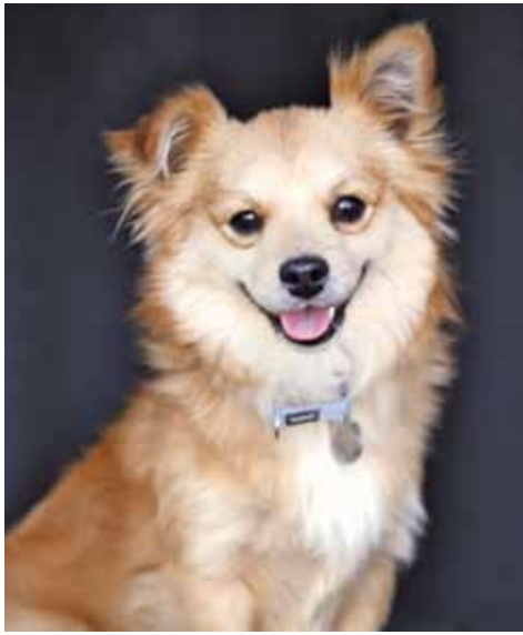
Billy is a sweet little guy who loves people..

Adopt a "pet without a partner" and give a homeless pet a second chance in life.