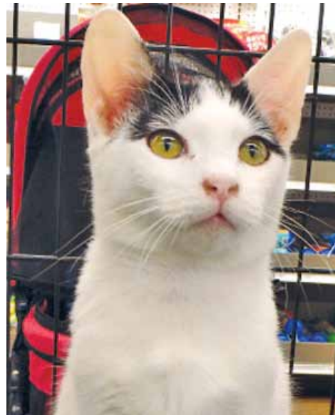
Micha is very adventurous and loves to explore.

Isabella is super affectionate, a total lap cat and loves belly rubs. Her big blue eyes will melt your heart and you will have a devoted companion who gives as much love as she gets. Her scoliosis makes her back a little crooked and has given her a spiral tail,