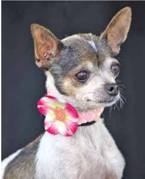
Mama Cass is only six pounds!

Mama Cass is sweet, friendly, gives lots of kisses and has a very bright sparkling personality. It's hard not to fall in love with her the instant you meet her. She is right around 4-6 years old and weighs 6 pounds. This is a really nice little girl who loves to be carried around or sitting on your lap or next to you on the couch. She is your