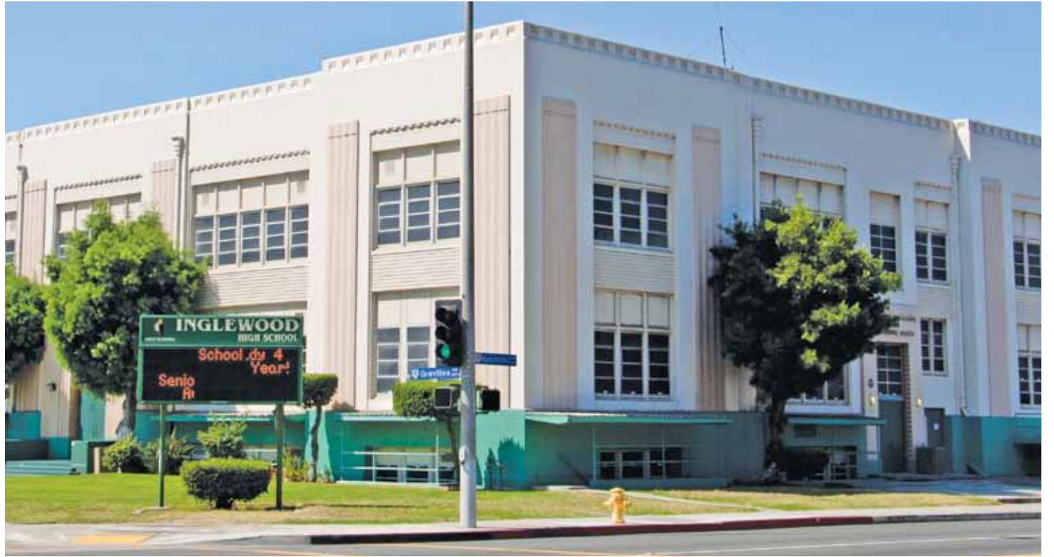
Inglewood High School recently received $35,000 in grand funding to help found Inglewood High Law School Academy to teach students critical thinking, writing, research, and debate.