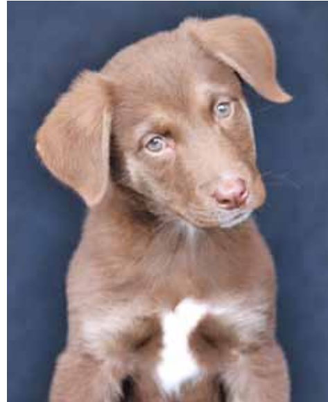
Gypsy is a shepherd/Lab mix.