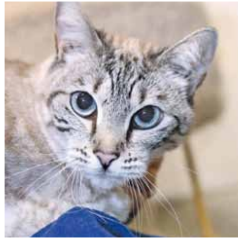
Isabella is a very affectionate and devoted companion.

Looking for your purr-fect match? Kitties of every color and size waiting to meet you.