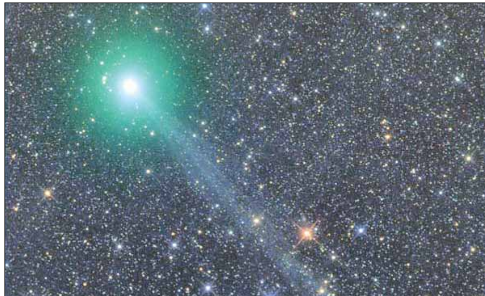
The new Comet Lovejoy, C/2014 Q2, as imaged on November 27th by Gerald Rhemann in Austria using a remotely operated 12-inch f/3.6 astrograph in Namibia.

To the unaided eye, Comet Lovejoy might be dimly visible as a tiny circular smudge under dark-sky conditions. Through binoculars