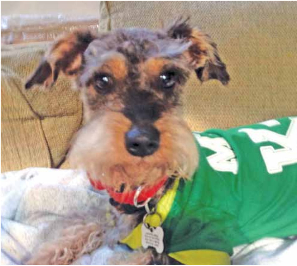
Flanagan loves new friends of the dog or human variety.

We are looking for volunteers to help with our Saturday pet adoption events, which are held at the Petco located at 537 N. Pacific Coast Highway, Redondo Beach 90277. If you are interested in volunteering and can commit to at least one Saturday a month, please contact us at info@msfr.org