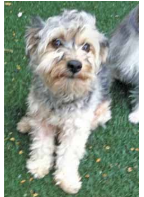
Paris is a loving dog who would cuddle up with an owner.