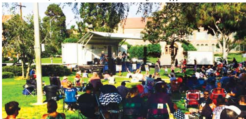
The band at the Summer Concert.

If the music was not enough, the event also had food trucks, including the Grilled Cheese Truck, yum, which was incredibly fun. In the park gazebo there was face painting and crafts for kids. Everyone was smiling and happy!