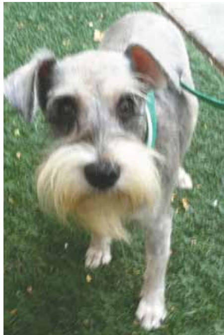
Kristy has been mistreated and needs a new loving family.

Hi there, it's me, Flanagan , and I'm a playful 2-year old male Miniature Schnauzer mix. We are guessing that I may have a bit of Doxie in me since I am low to the ground, only weigh 14 pounds and have a wiry coat. Everyone says that I am cute as a button and smart as a whip. It's hard to believe that I was turned in to a LA county shelter as a stray. It was almost three weeks and I was running out of time when MSFR came to my rescue. I love to go to the dog park, play ball, go for hikes and I'm happy just being with my family. I'm a likeable youngster who gets along well with other dogs. In fact, I think I