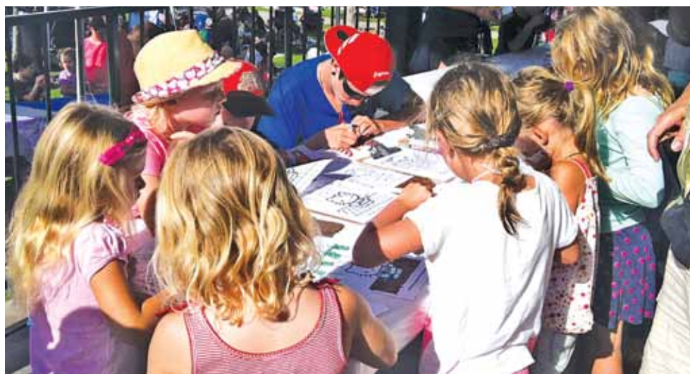
Kids doing coloring crafts in Library Park.

El Segundo holds events such as this one frequently, and it is a nice way to bring the community together for a special afternoon. In El Segundo you can walk out your door and you are at a concert. Running into friends and classmates could happen to a student. Meeting new people who are also a part of the community is frequent. You can wear jeans, sweats, a nice sundress, hats, beanies, sandals, Uggs, virtually anything. And the