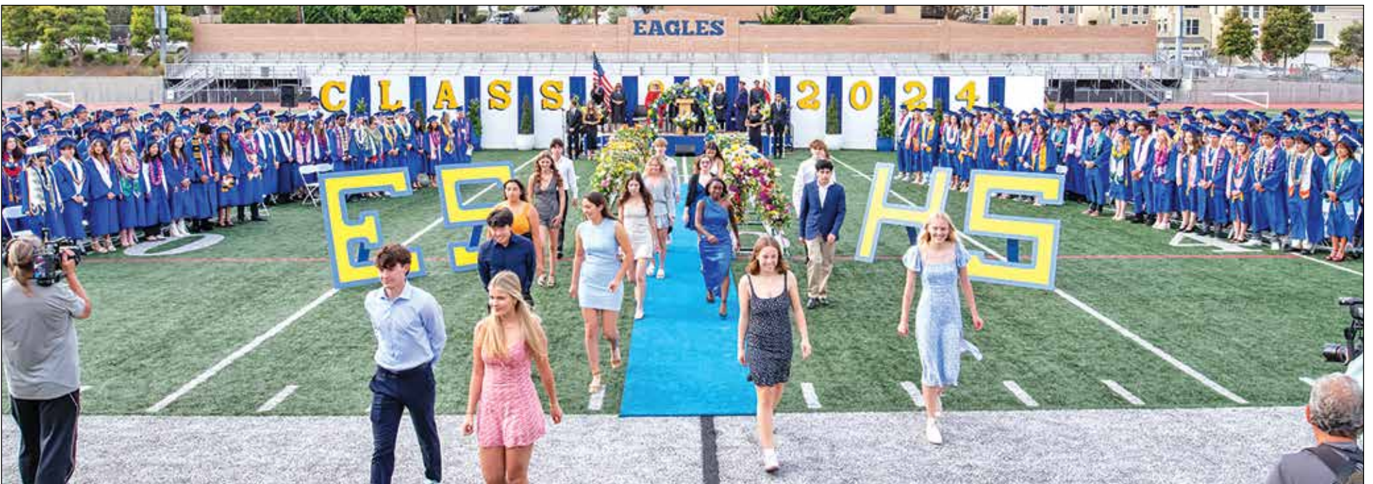
Junior class members head to their seats after placing the flower arches they made and carried for the Senior class.