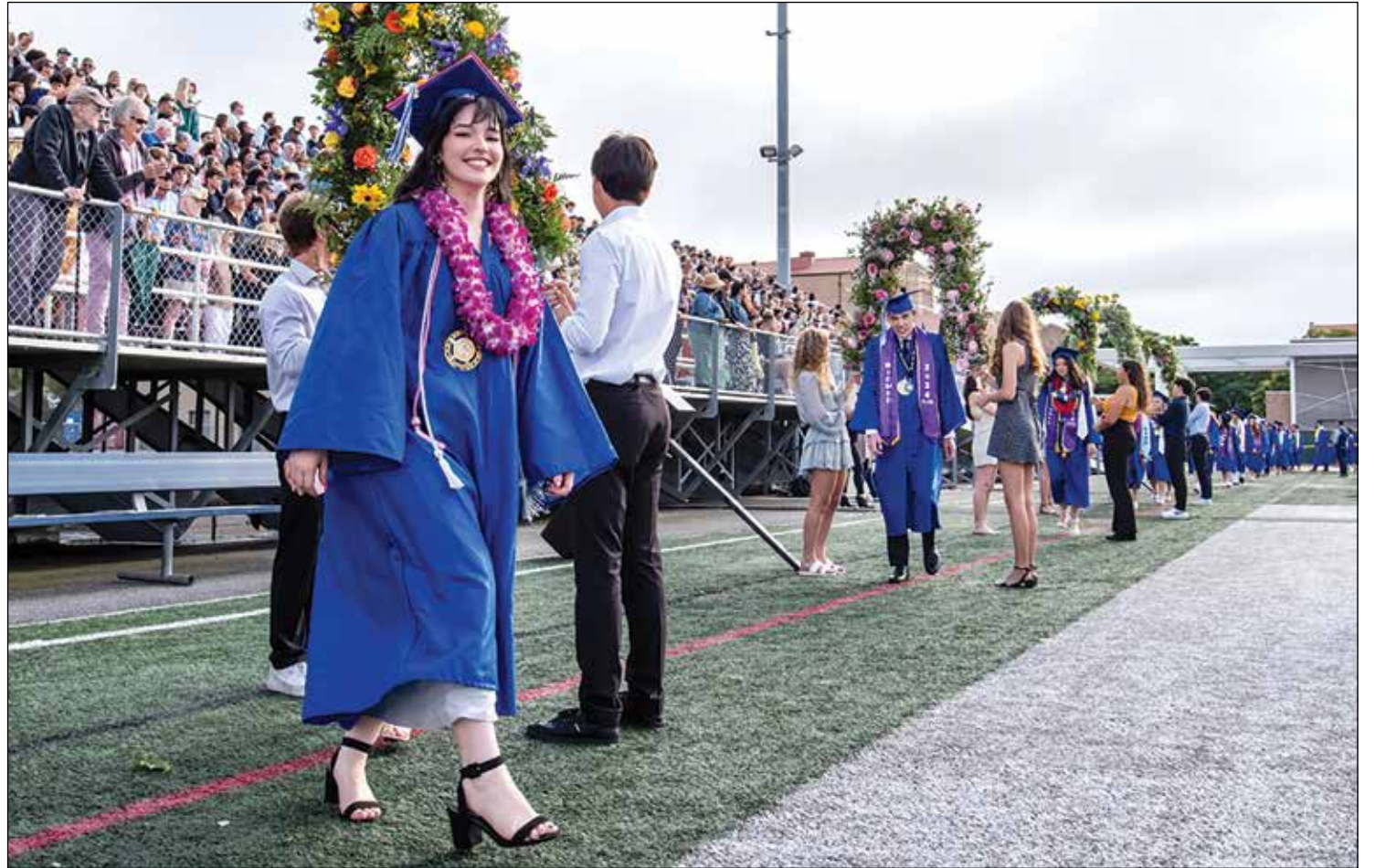
Seniors enter the field through an archway of flowers created and held aloft by Juniors. For more photos see pages 2 and 16.