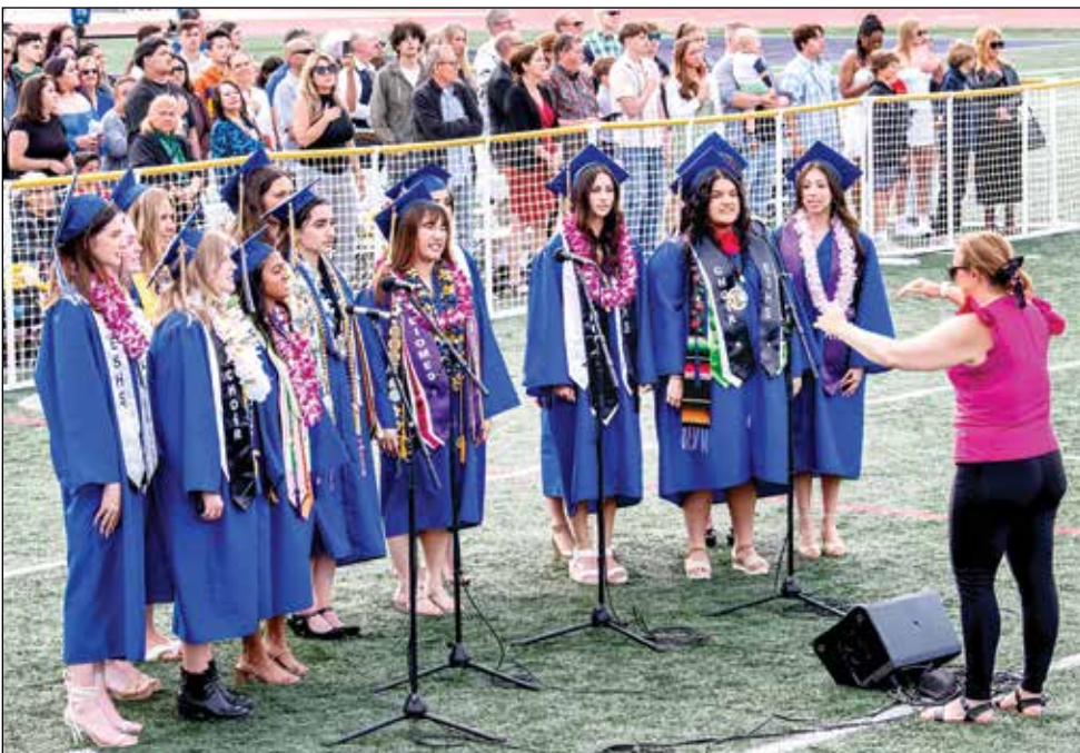
The ESHS Senior choir members lead the audience in the National Anthem at the beginning of the graduation ceremony.