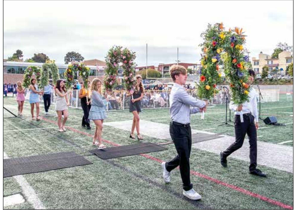
Members of the Junior class enter carrying floral arches they built.