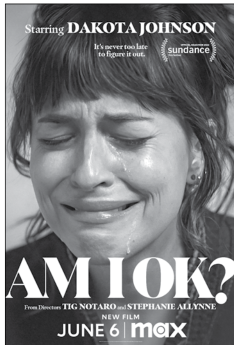
In AM I OK? , courtesy of Max.

At its core, AM I OK? is a love story about female friendship and the strength it takes to be honest about the evolutionary journey that is life. We are all destined to change and grow the older we get, and sometimes that means being more honest with ourselves. As Lucy learns through her highs and lows of self-discovery, fear shouldn't dictate the choices you make. Yes, it's scary to face rejection or disappointment but it's even more terrifying to look back on life and realize you've missed out on what you truly wanted.