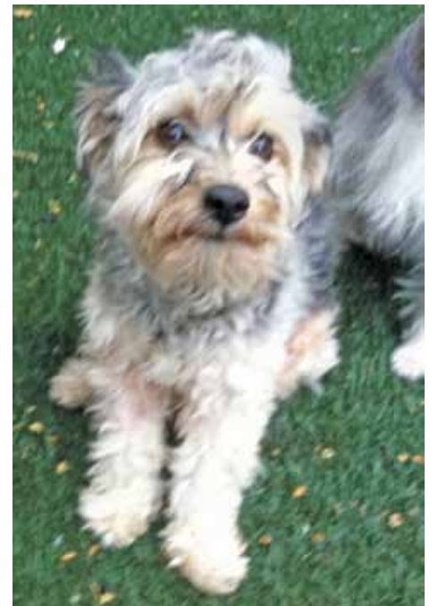
Paris is a loving dog who would cuddle up with an owner.