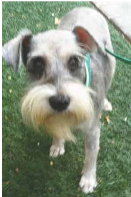
Kristy has been mistreated and needs a new loving family.

Hi there, it's me, Flanagan , and I'm a playful 2-year old male Miniature Schnauzer mix. We are guessing that I may have a bit of Doxie in me since I am low to the ground, only weigh 14 pounds and have a wiry coat. Everyone says that I am cute as a button and smart as a whip. It's hard to believe that I was turned in to a LA county shelter as a stray. It was almost three weeks and I was running out of time when MSFR came to my rescue. I love to go to the dog park, play ball, go for hikes and I'm happy just being with my family. I'm a likeable youngster who gets along well with other dogs. In fact, I think I would be great to